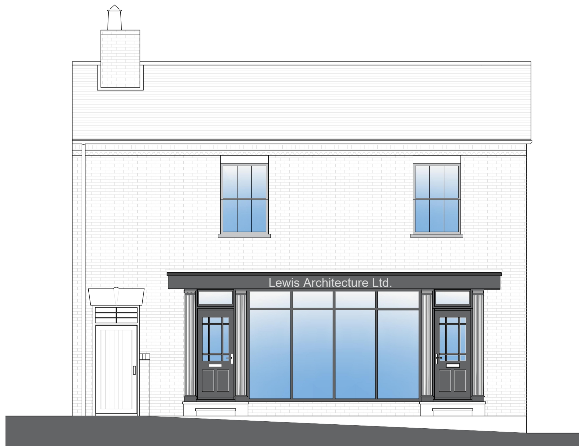
Proposed Front Shop Elevation

Aluminum powder coated windows and apostrophes