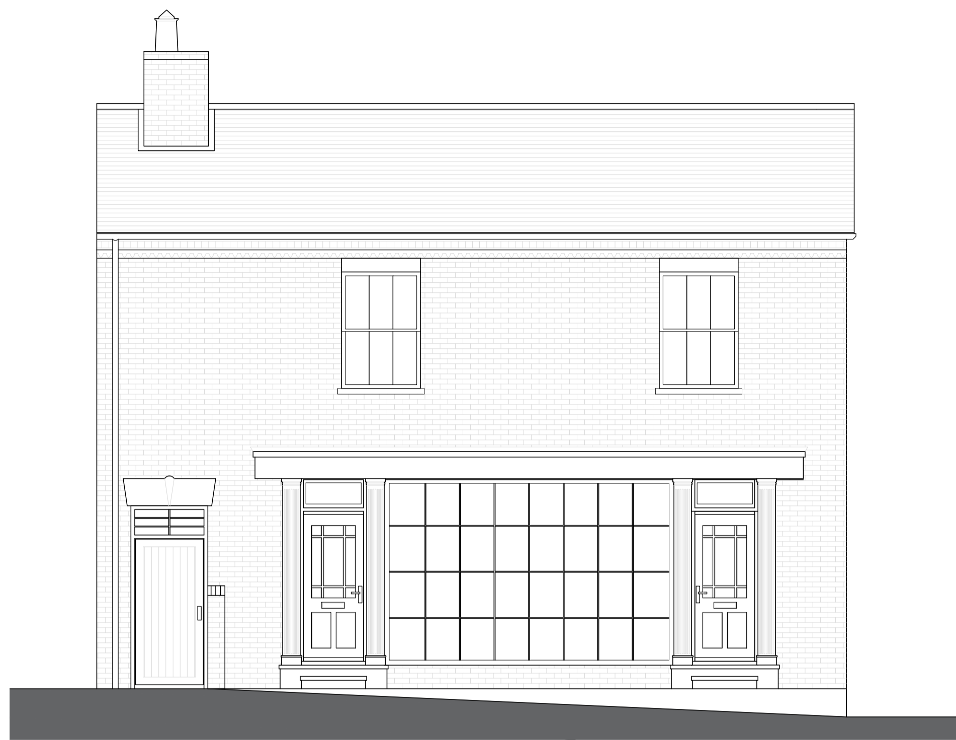
Existing Front Shop Elevation