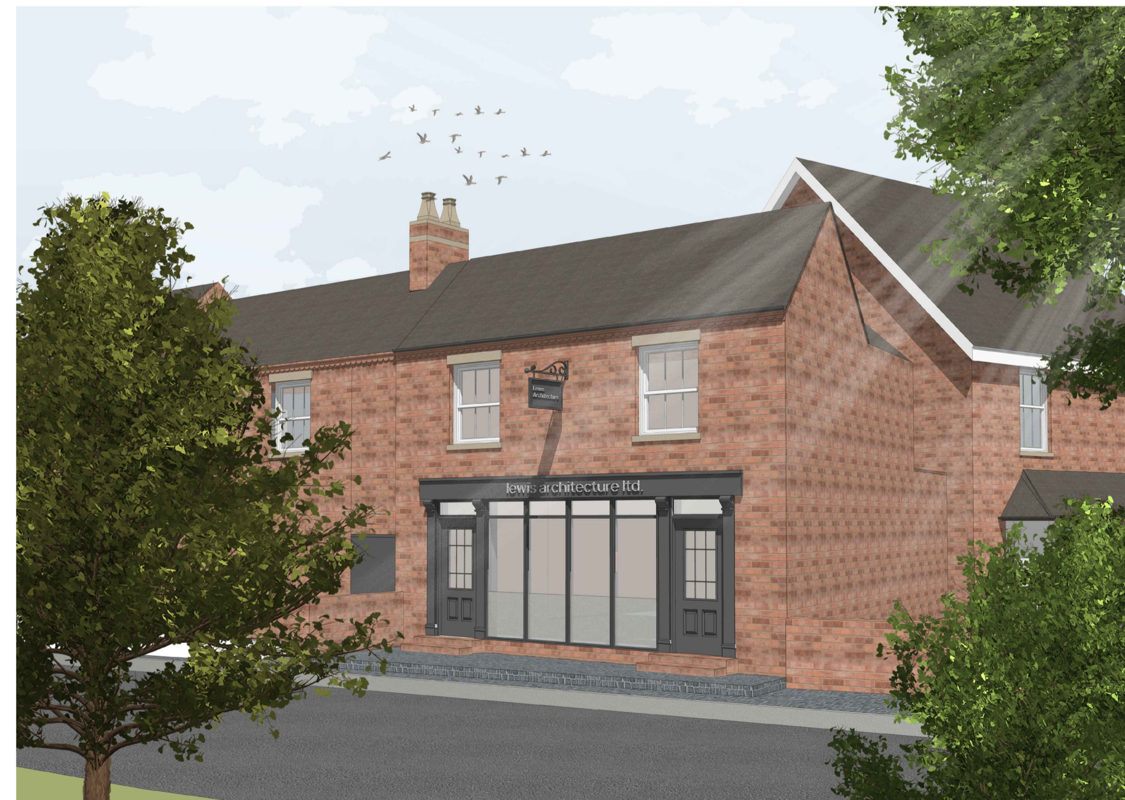
Proposed Front Shop Elevation

Aluminum powder coated windows and apostrophes