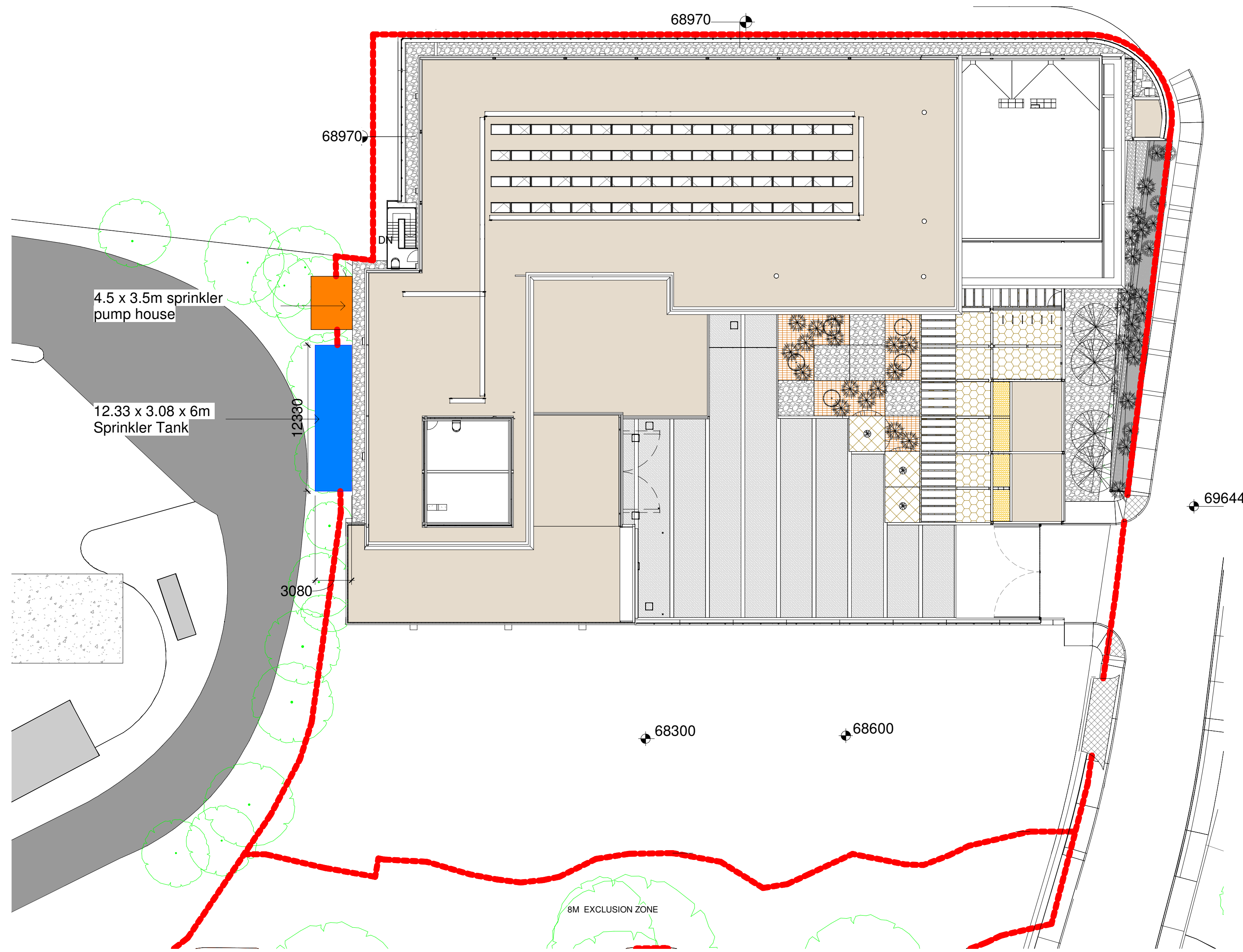
1 Proposed Site Plan - Sprinkler Tank Plan Location 1 : 250