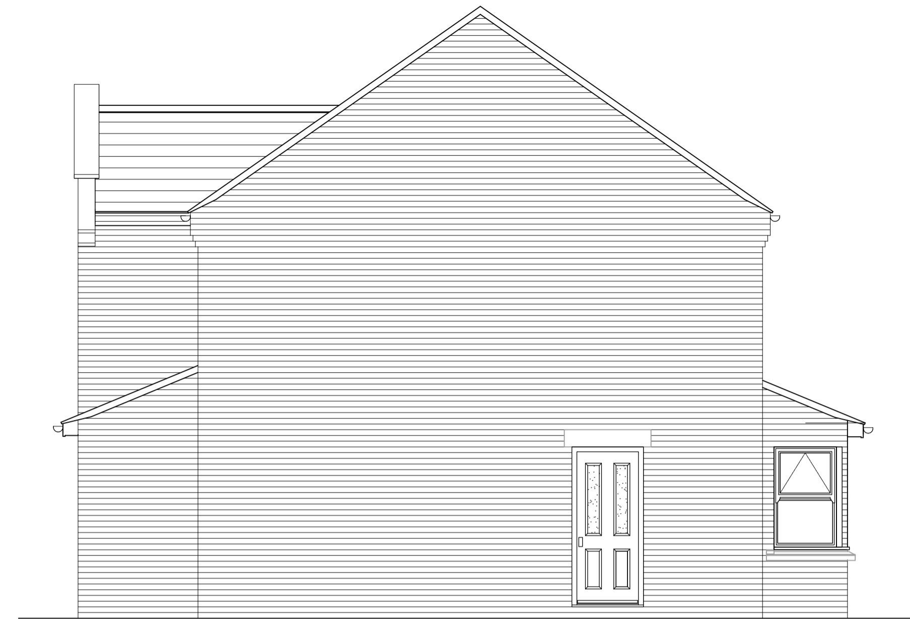
EXISTING SIDE ELEVATION (1:50)