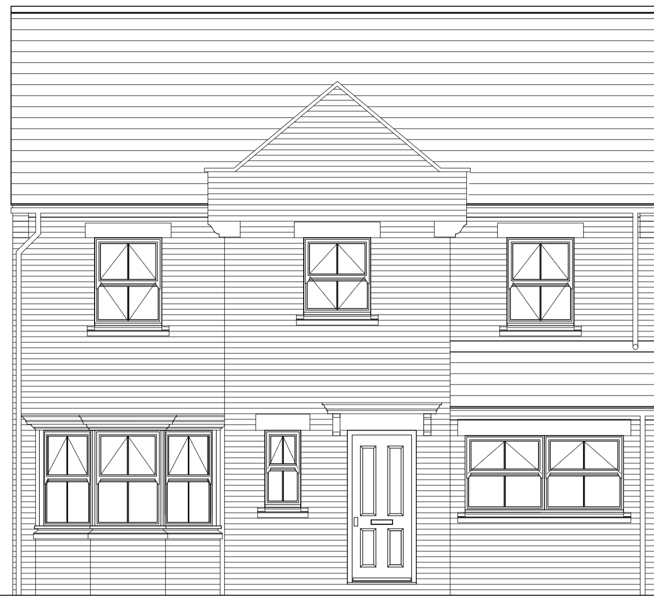
EXISTING FRONT ELEVATION (1:50)

It is assumed that all works will be carried out by a competent contractor working, where appropriate, to an approved method statement.