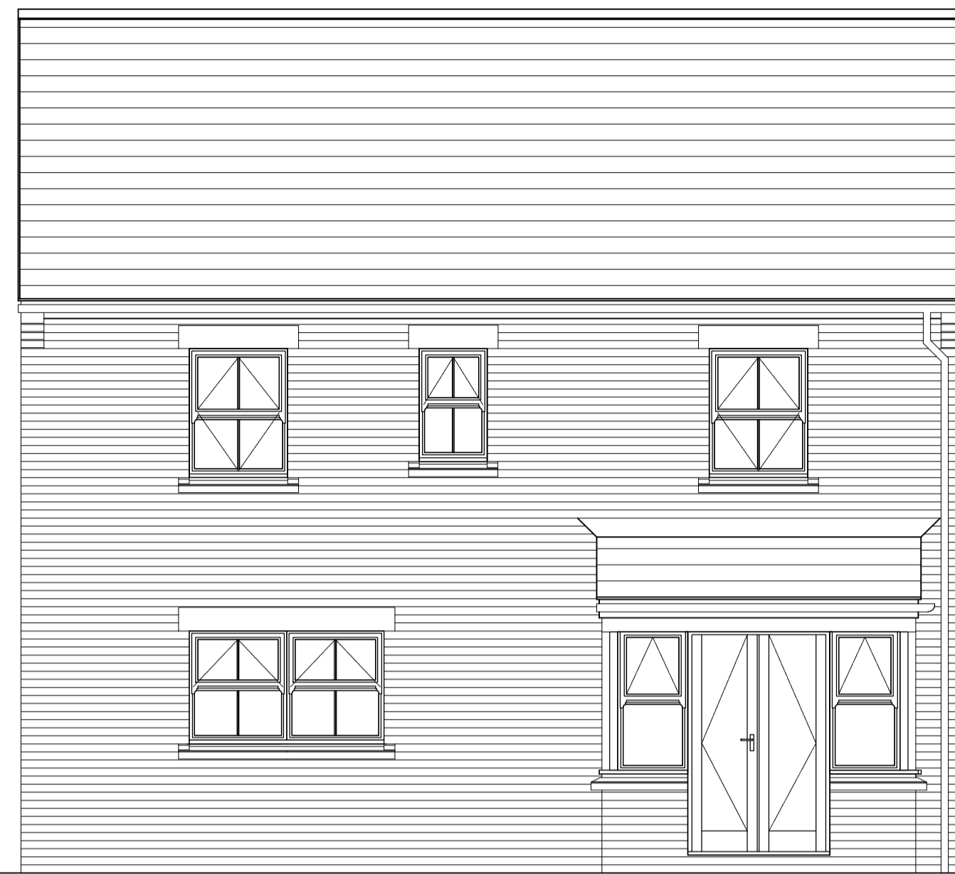
EXISTING REAR ELEVATION (1:50)