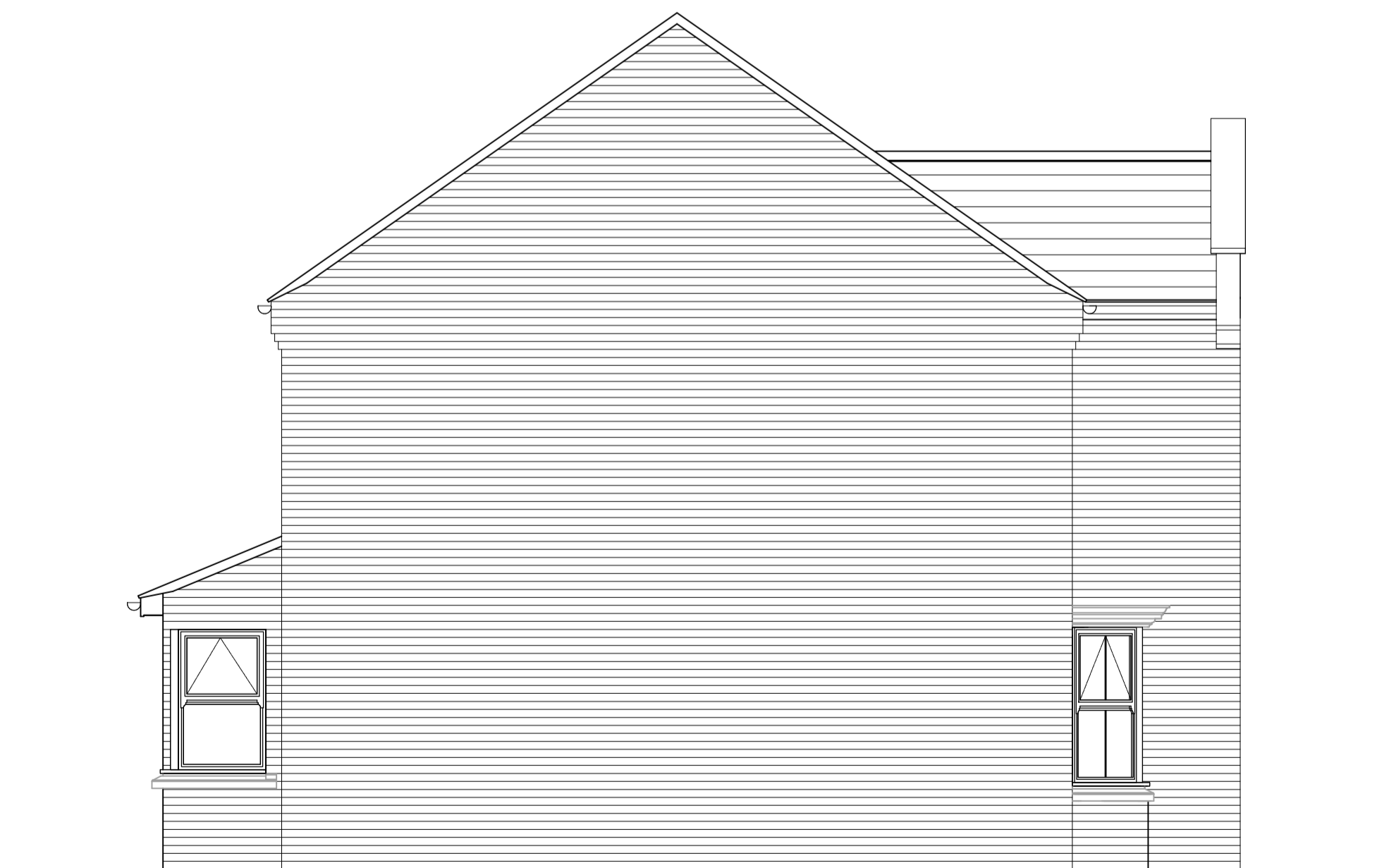
EXISTING SIDE ELEVATION (1:50)