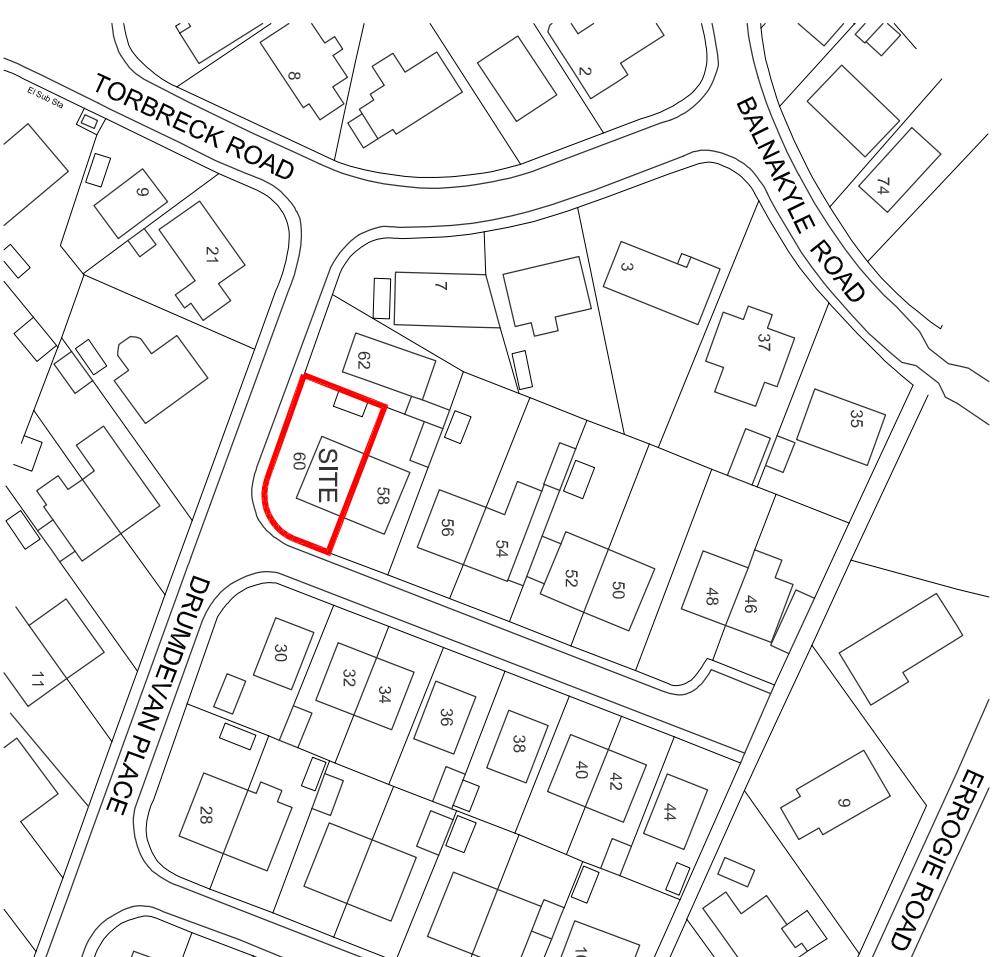
Location Plan (scale 1:1250)