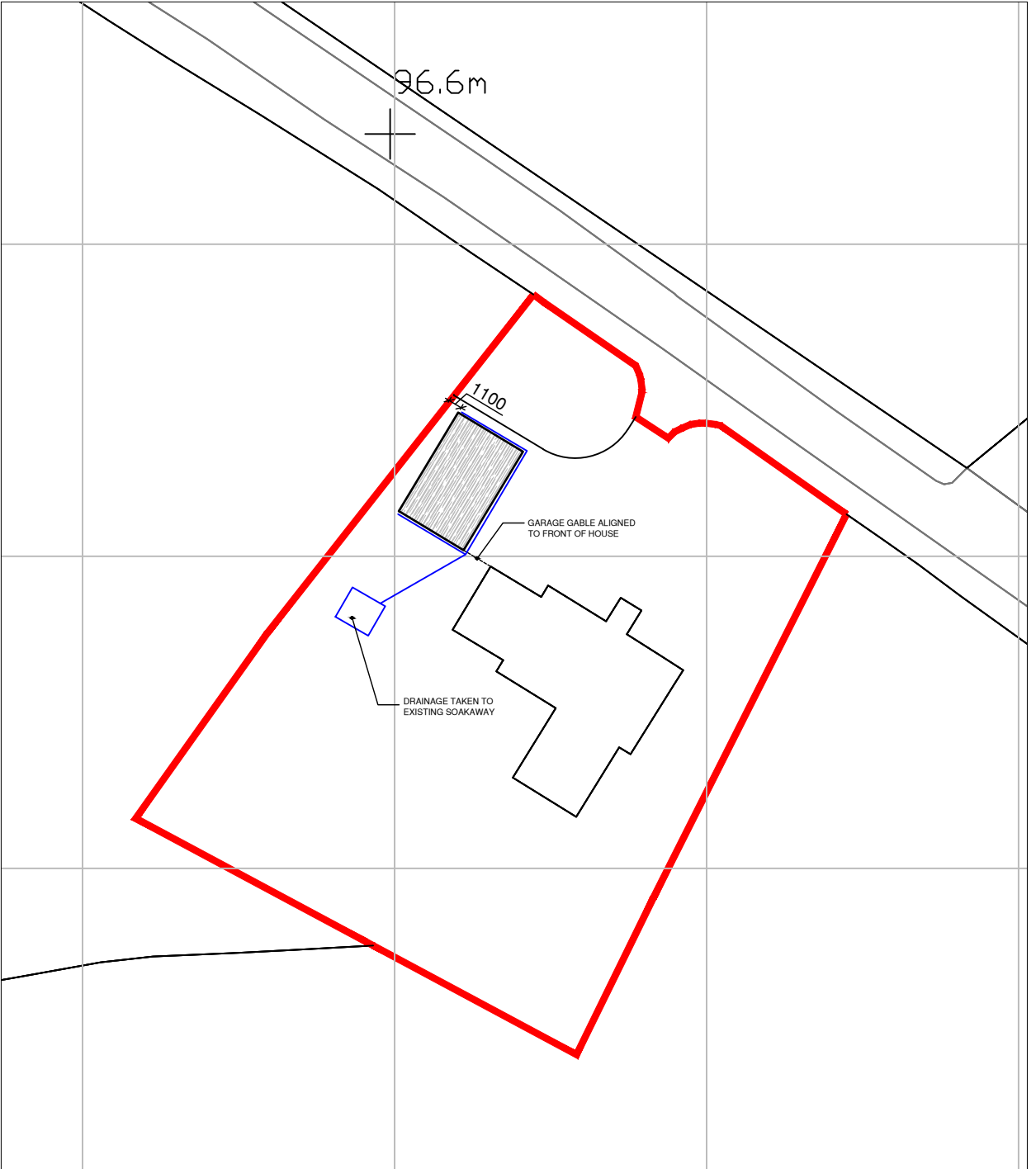
SITE PLAN SCALE 1/500