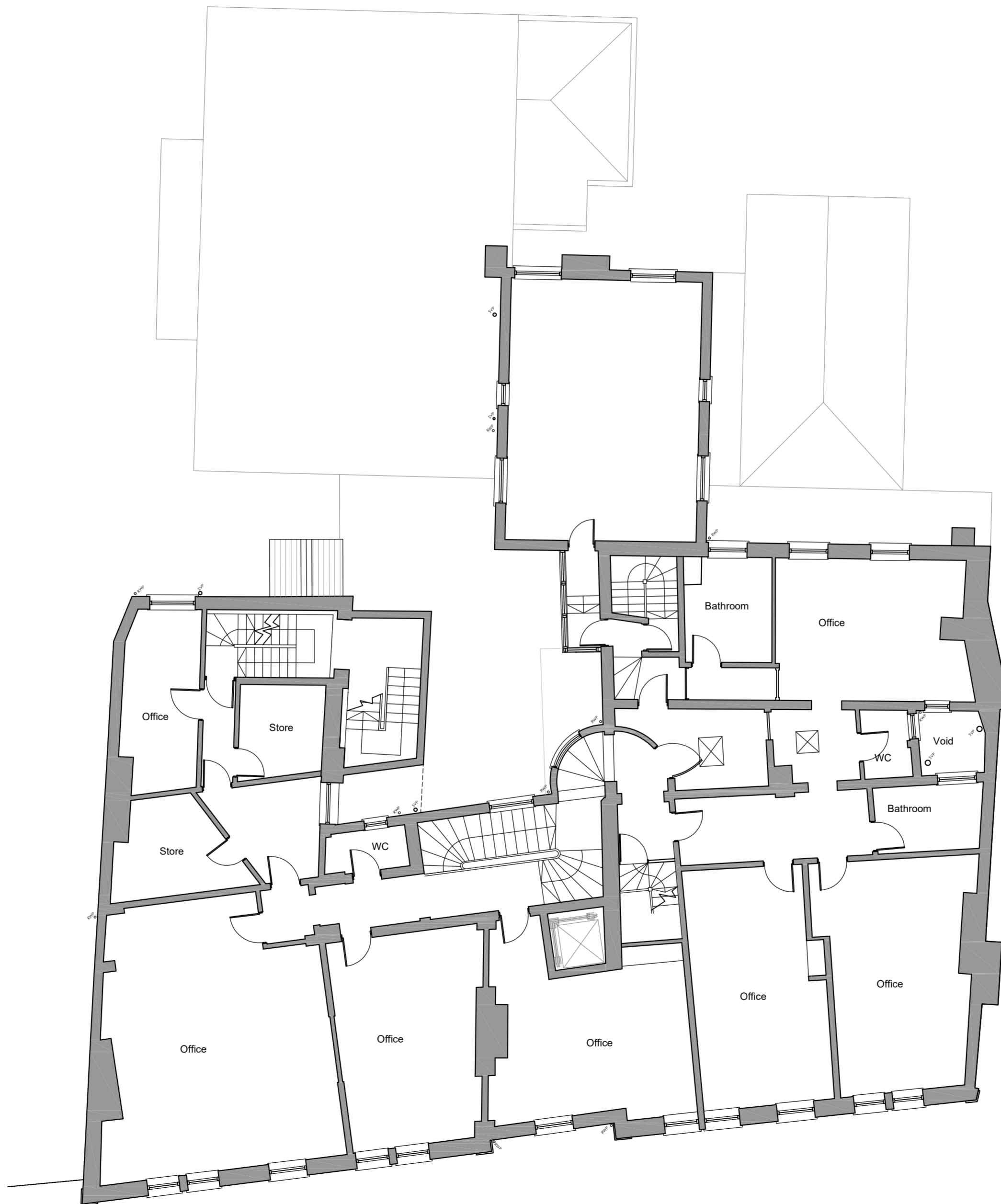
Existing Second Floor Plan