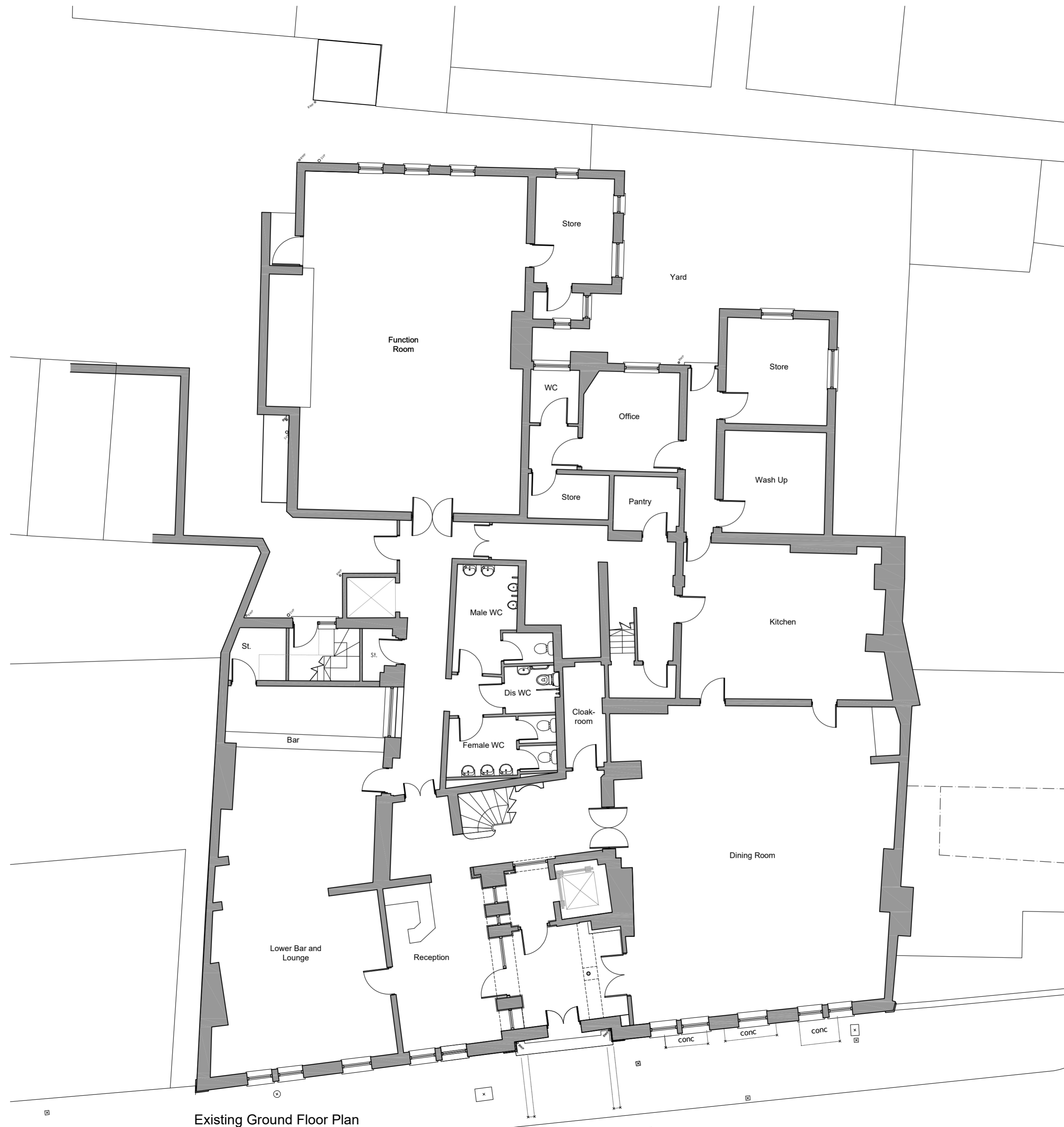
Existing Ground Floor Plan