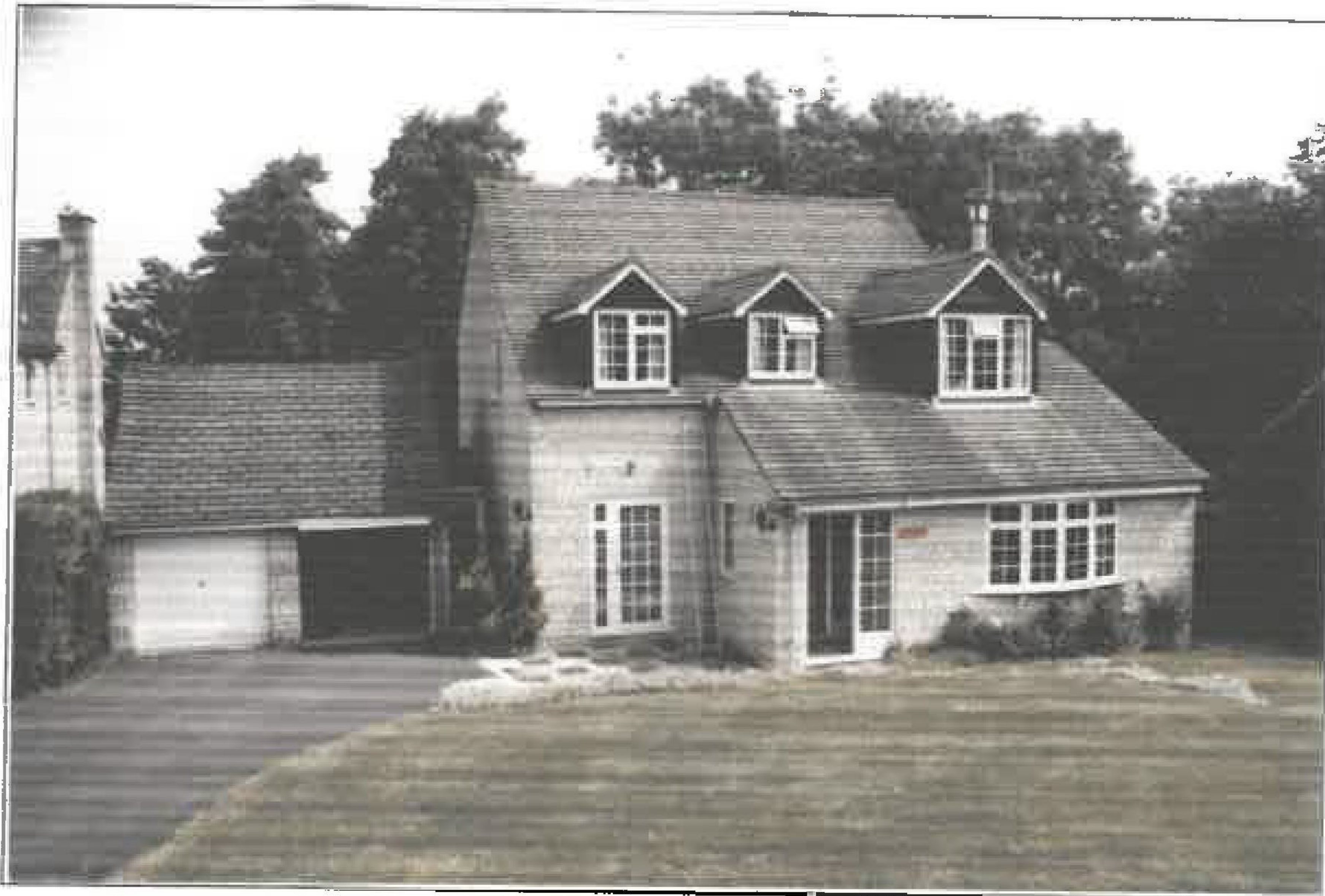
1. Front elevation - general view.