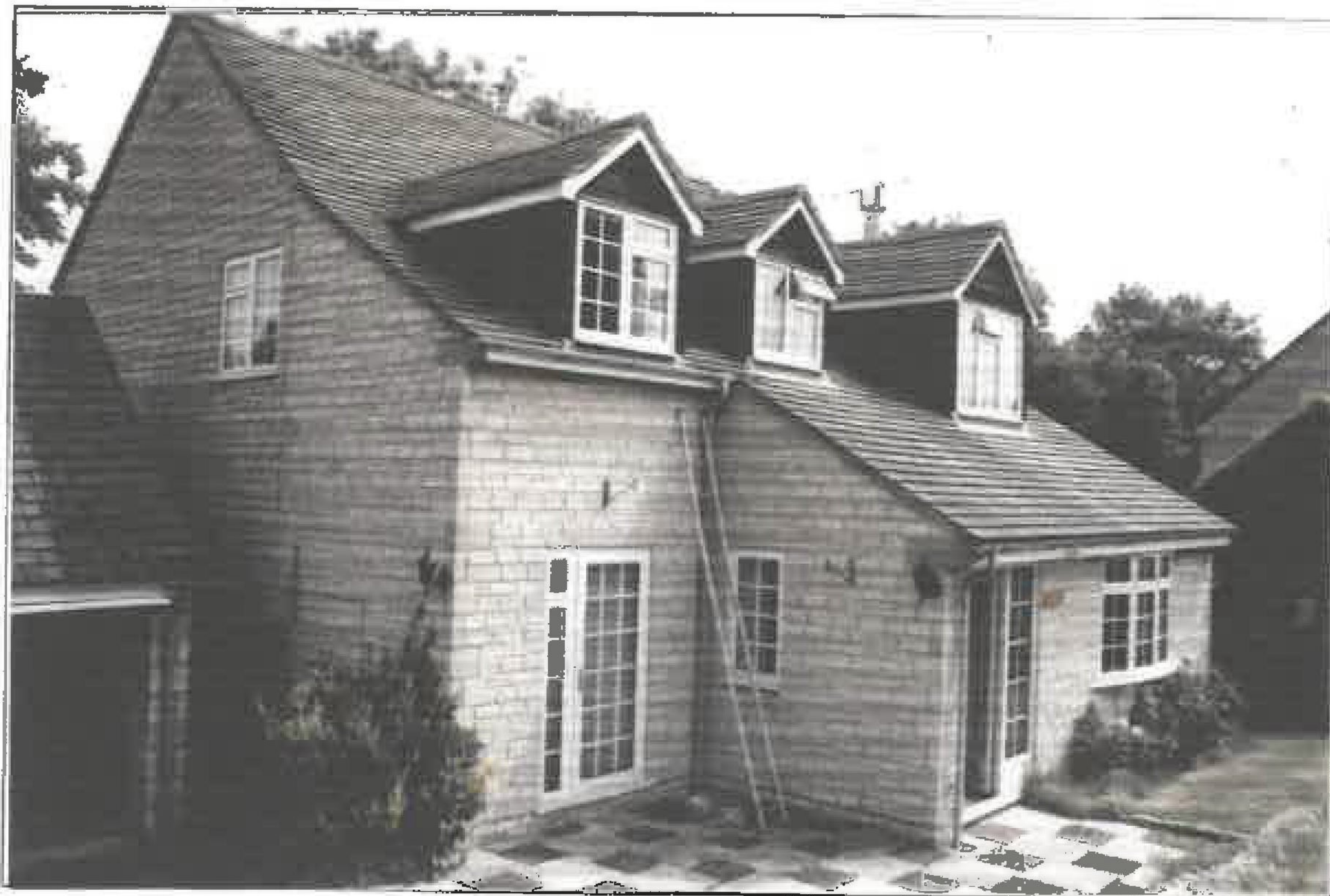
2. Main house - closer view of front elevation from south-west.