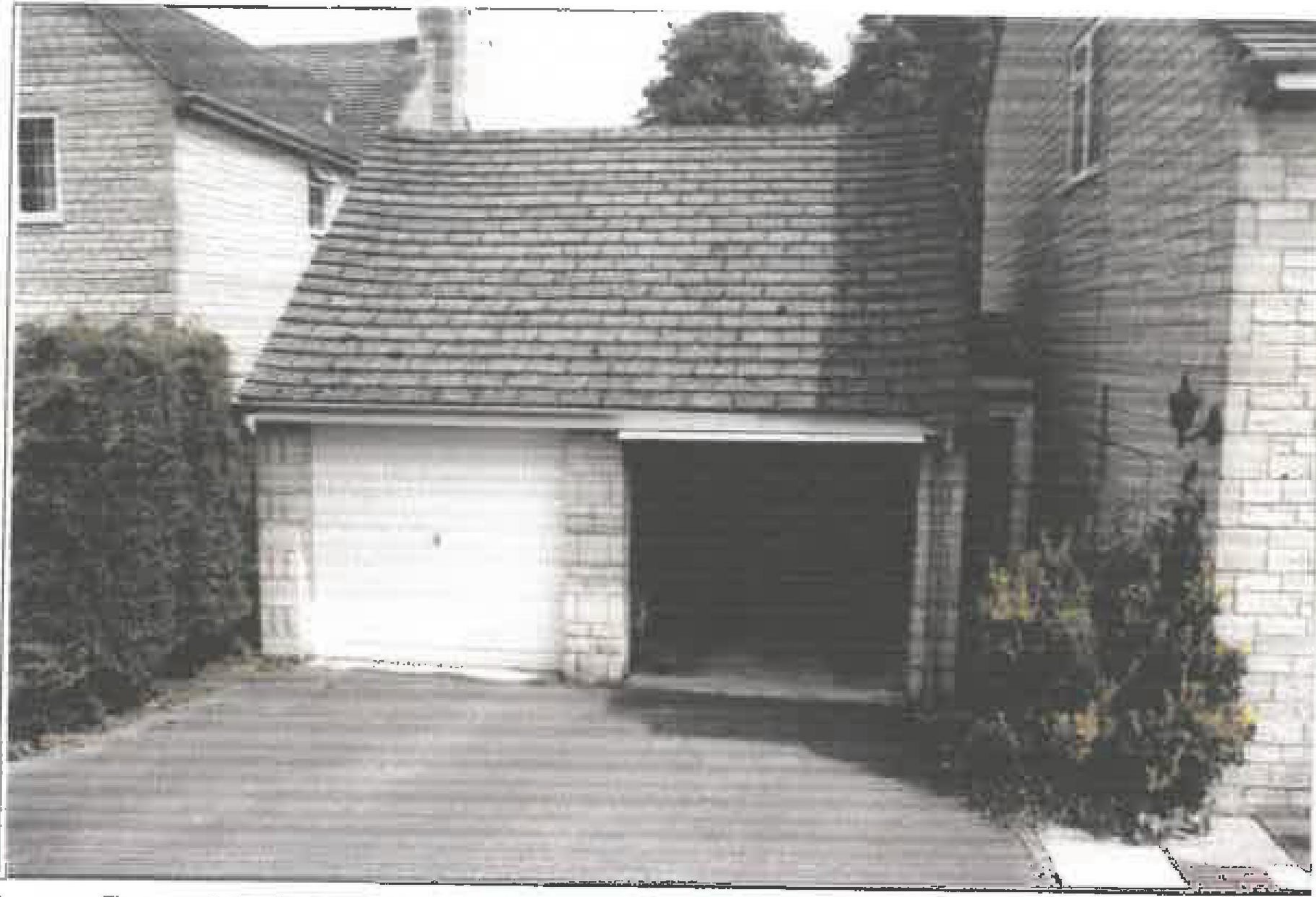
8. Garage block - south elevation.