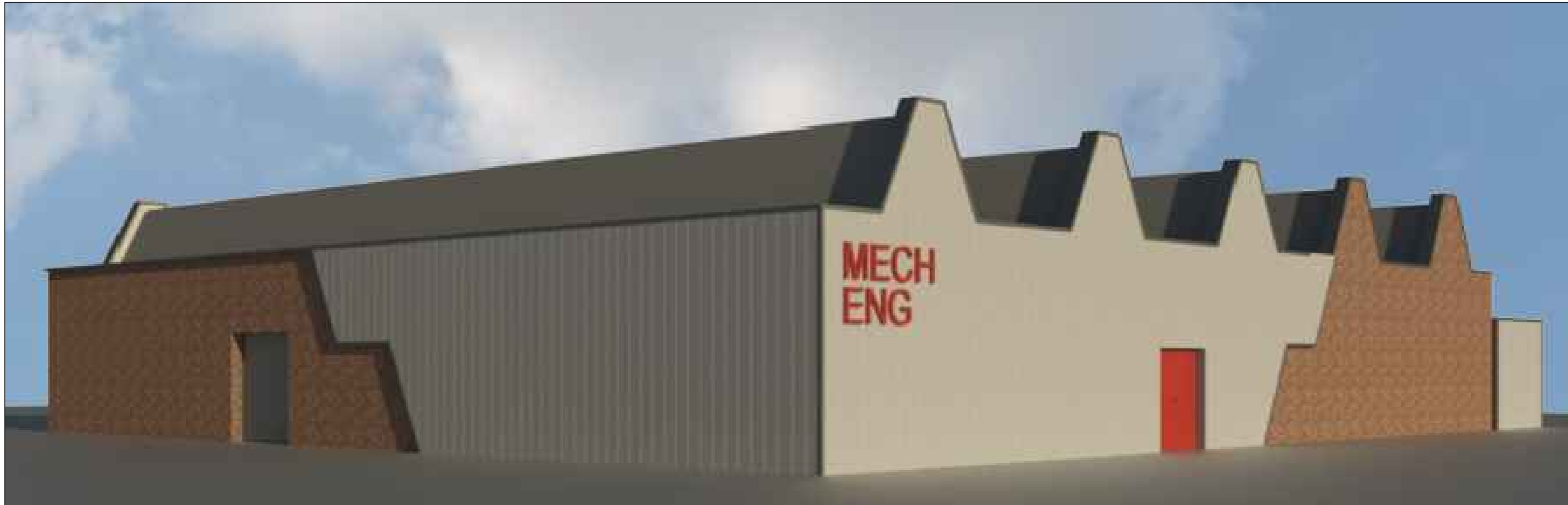
CONCEPT DESIGN | VIEW 2