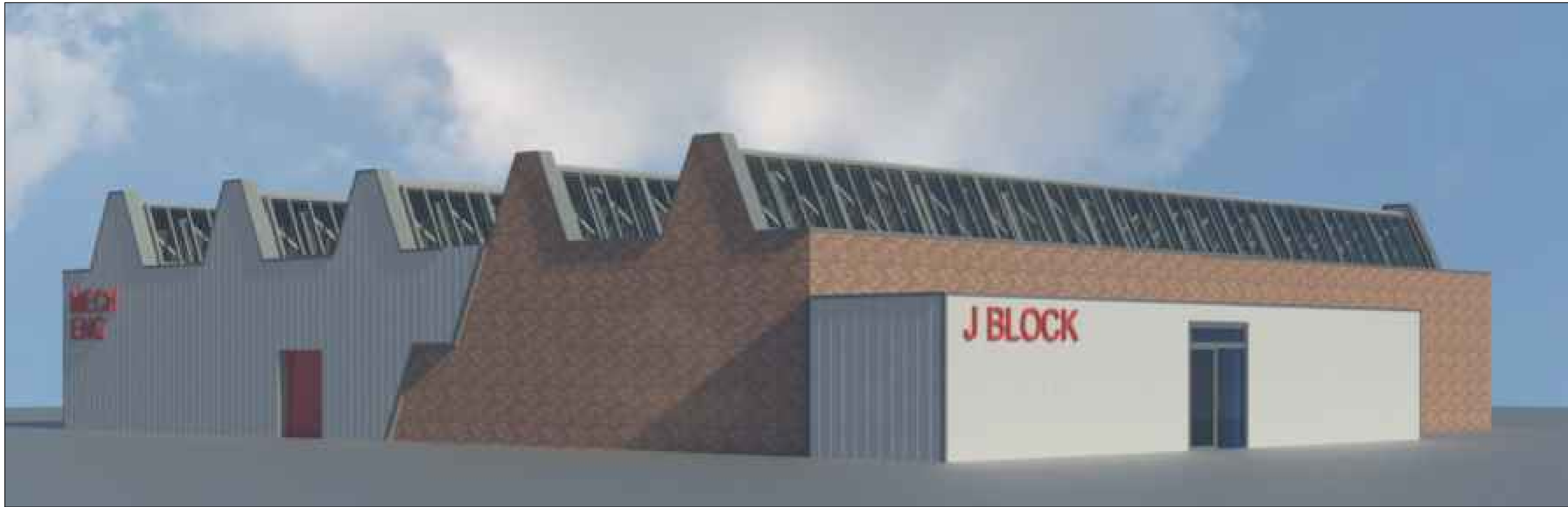
CONCEPT DESIGN | VIEW 1