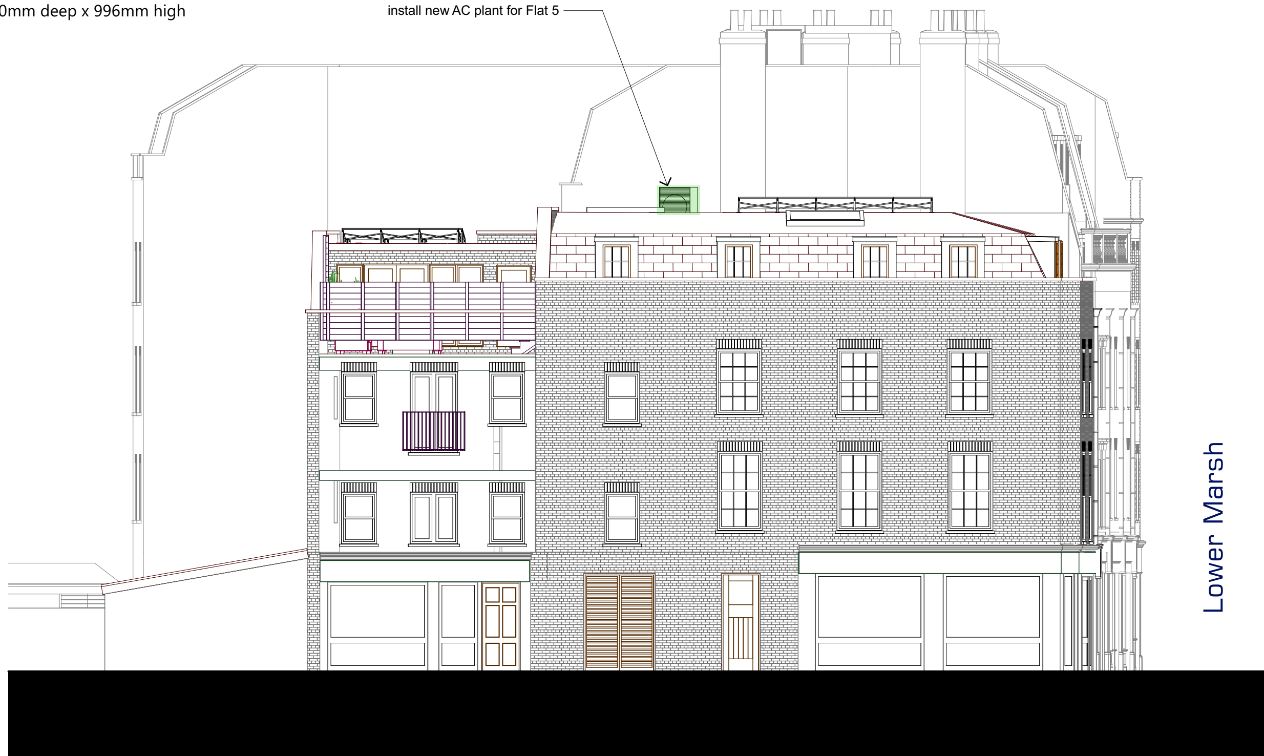
Frazier St elevation scale 1:100