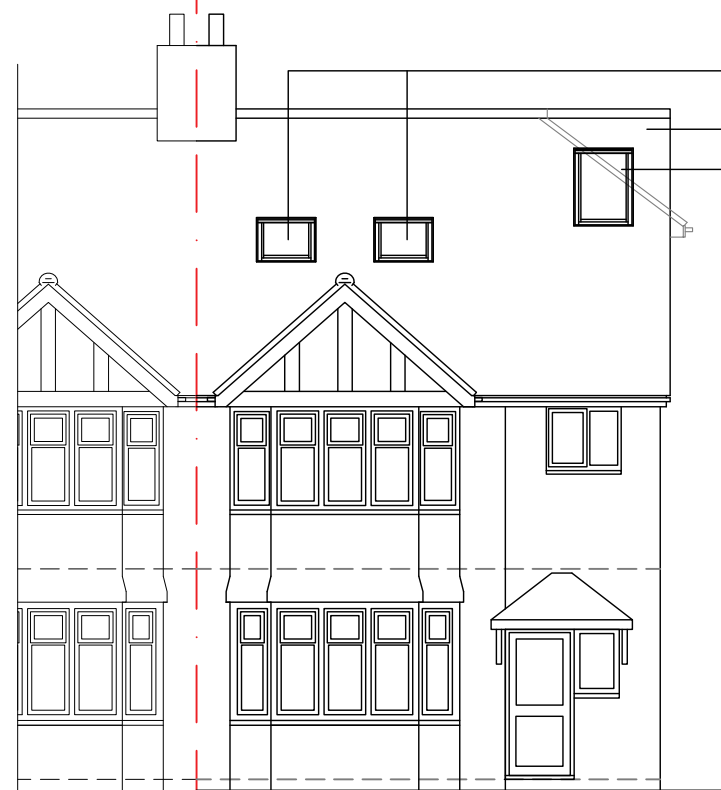
WEST FRONT ELEVATION

GLASS BALUSTRADE TO JULIETTE BALCONY NEW VELUX WINDOW GABLE END EXTENDED NEW VELUX WINDOW TILE HUNG DORMER EXTENSION PAINTED TIMBER DOUBLE GLAZED WINDOWS PAINTED TIMBER DOUBLE GLAZED DOORS