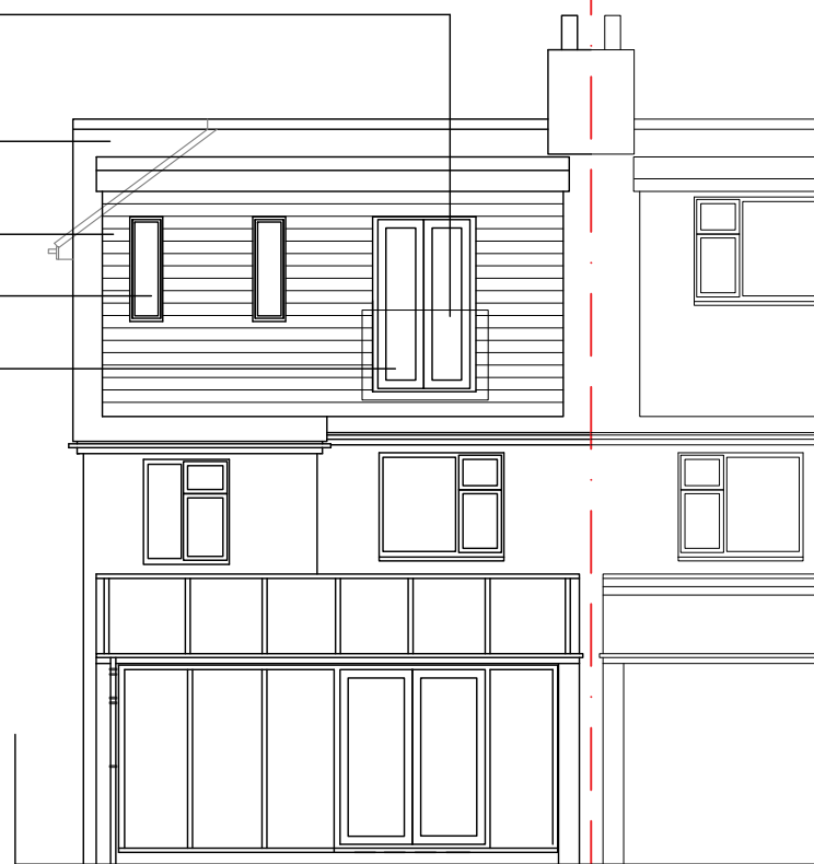
EAST REAR ELEVATION

GLASS BALUSTRADE TO JULIETTE BALCONY NEW VELUX WINDOW GABLE END EXTENDED NEW VELUX WINDOW TILE HUNG DORMER EXTENSION PAINTED TIMBER DOUBLE GLAZED WINDOWS PAINTED TIMBER DOUBLE GLAZED DOORS