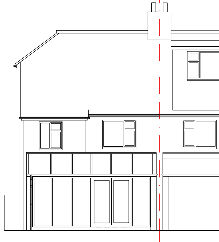
EAST REAR ELEVATION