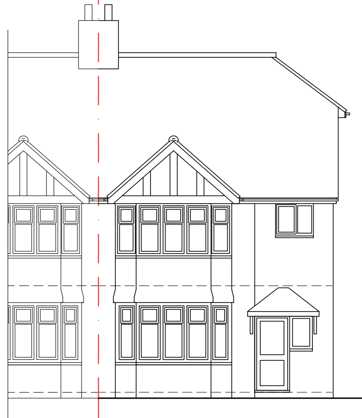
WEST FRONT ELEVATION