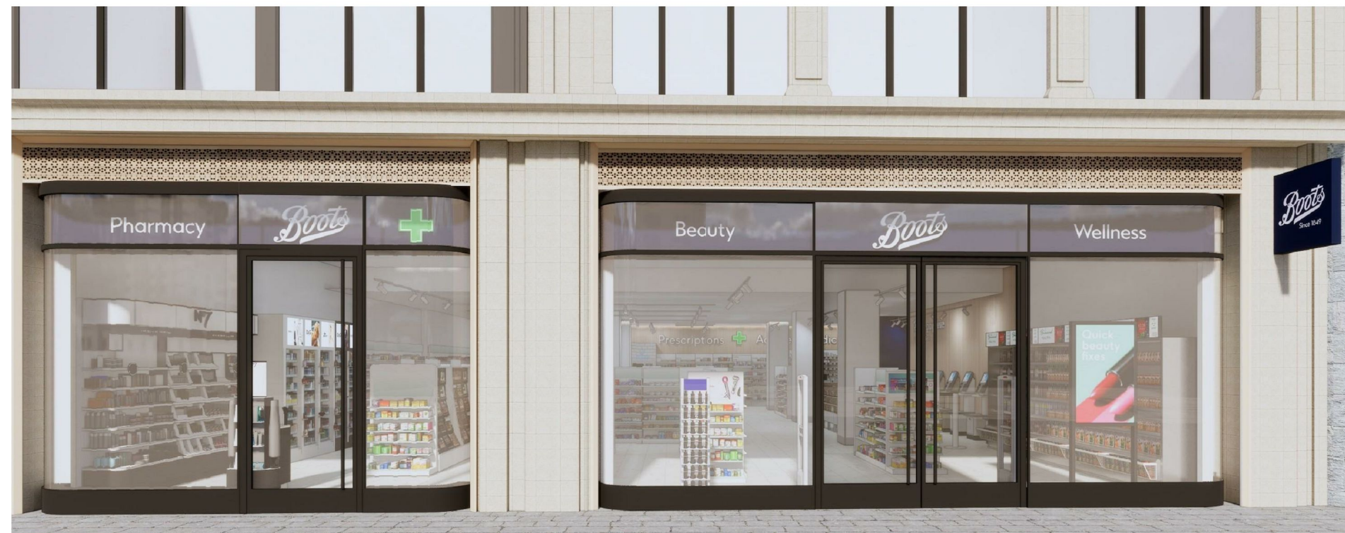
Proposed Shopfront Visuals - NOT TO SCALE