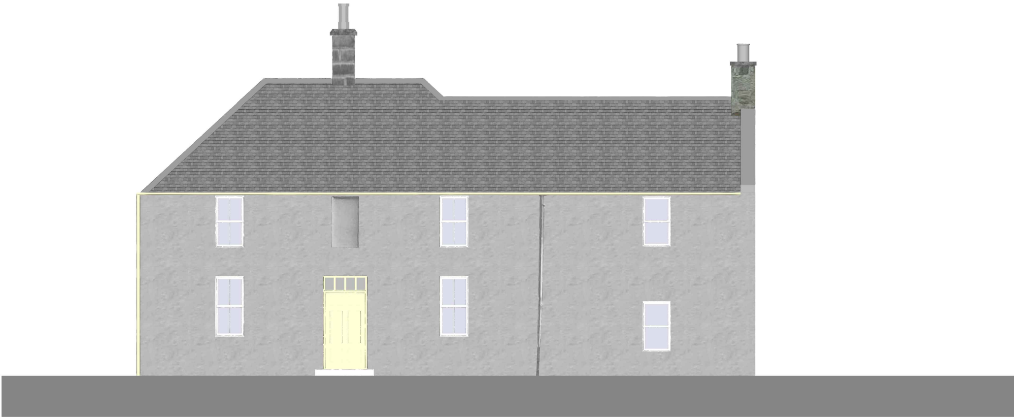
Front Elevations (North)