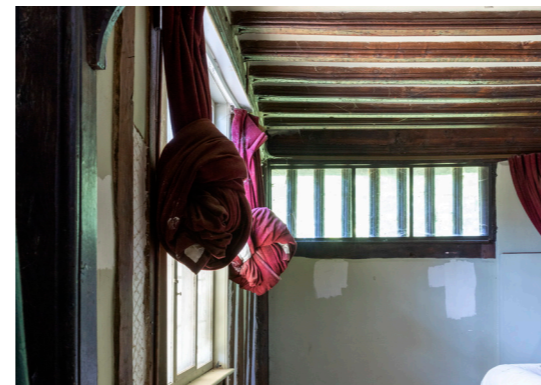
View of sitting room