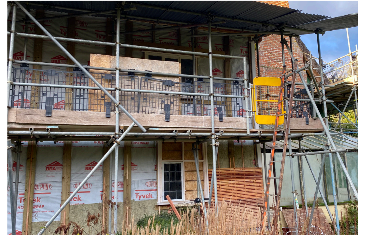
Scaffold on South-east elevation, Summer 2020

The clasped purlin roof structure to the Principle Wing is still largely intact, with curved wind braces. The roof structure to the Service Wing appears to have been destroyed by a fire at some point in the 19th or early 20th Century's. None of the original roof structure remains and all of the vertical oak stud framing between the principle oak studs at the Southern end of the Service Wing, which contains the Kitchen, has been replaced with softwood studs. The joweled principle post to the kitchen on the southeast elevation of the service wing has been turned 180 degrees, to face the external elevation and the first floor joists, supporting the bedrooms over the kitchen, are all softwood with a lath and plaster ceilings. The construction of the kitchen ceiling suggests a date for the replacement of the roof and first floor joists in the 19th century, as these all appear to be contemporary.