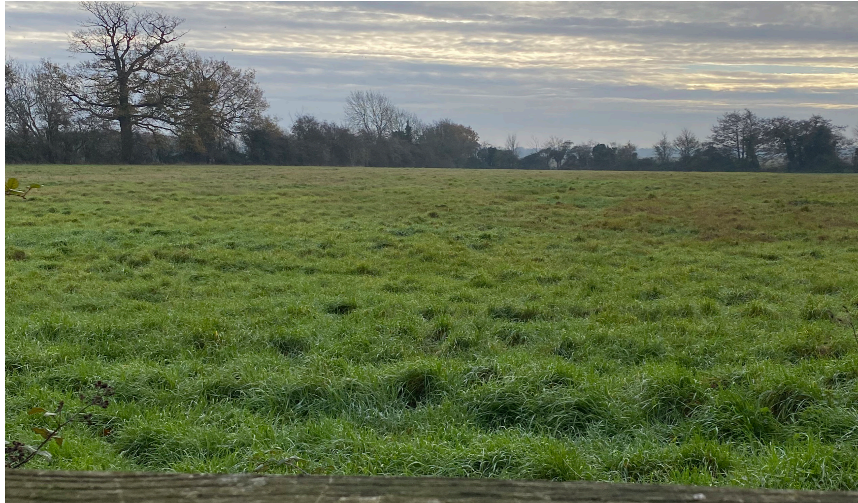
Access to the paddock