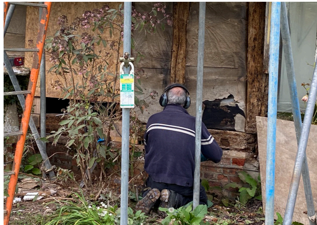
Timber frame repairs to South-east elevation