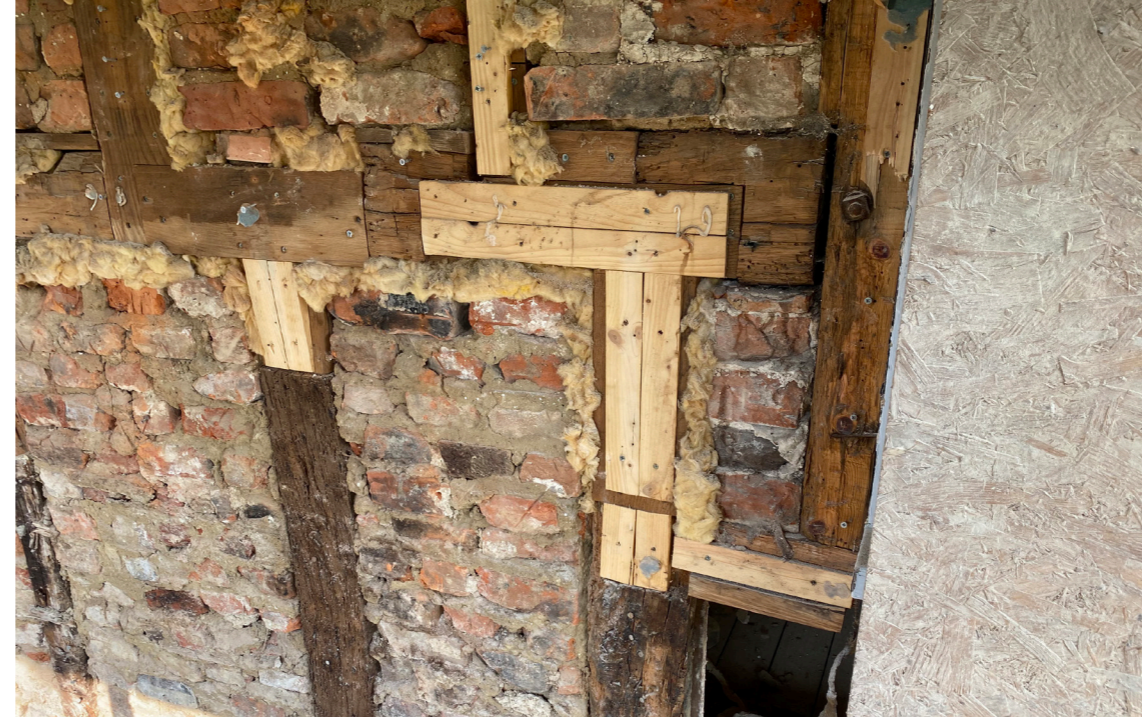
Previous face repairs to the original medieval eaves level plate