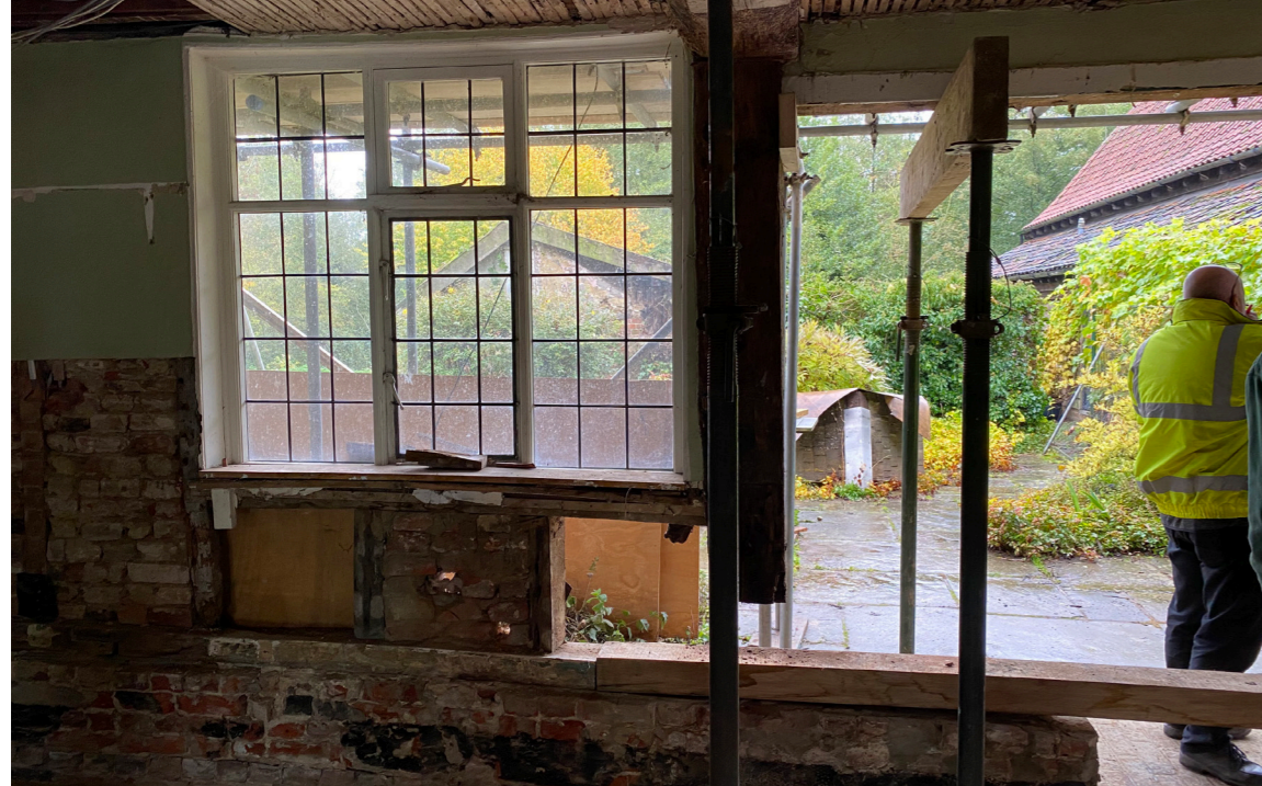
View of existing South elevation in kitchen