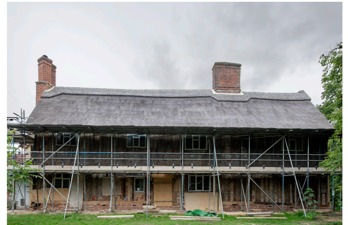
View of North-east elevation