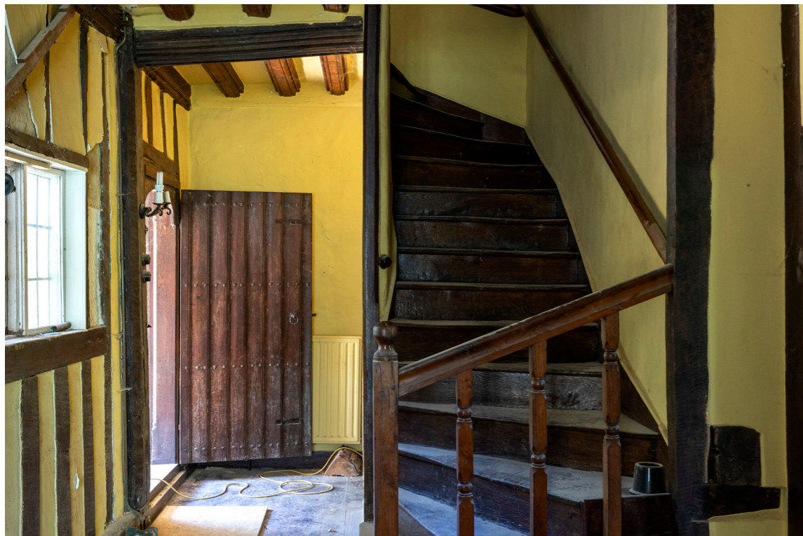
Interior view of hall

When constructed in the 1530's there was no direct access from the first floor of the Service Wing into the first floor to the Principle Wing. There simply wasn't sufficient headroom. However there is an opening at ground floor level providing access from the Principle Wing into the Service Wing. The door opening in the framing of the Principle Wing, cuts through an original mullion window opening, on the southwest elevation to the Principle Wing. The Principle Wing must have been erected first, with the Service Wing added shortly after the construction of the Principle Wing.