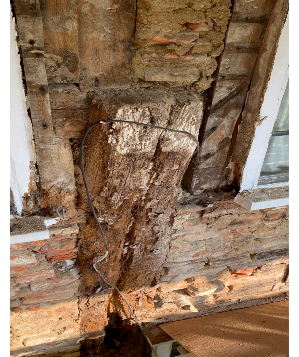
Detail of the original timber frame principal post, which forms the left hand jamb to window GW12