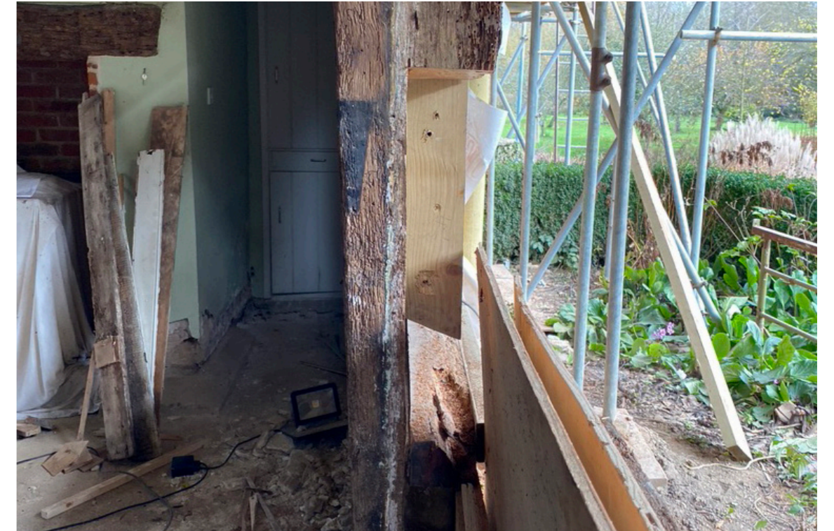
Door opening on South-east elevation