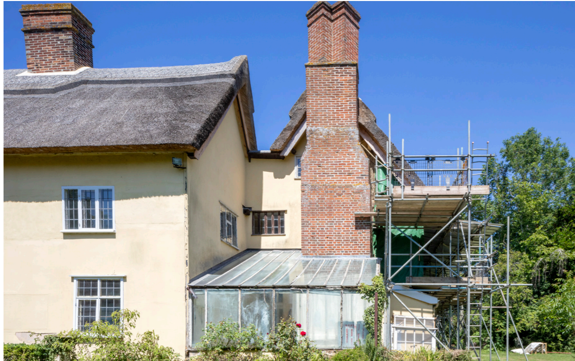
View of existing conservatory