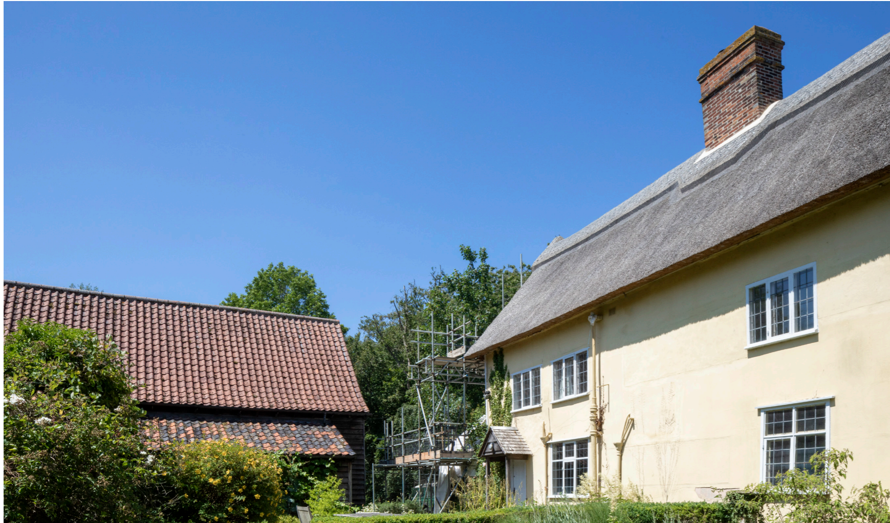
View showing South-east elevation and courtyard