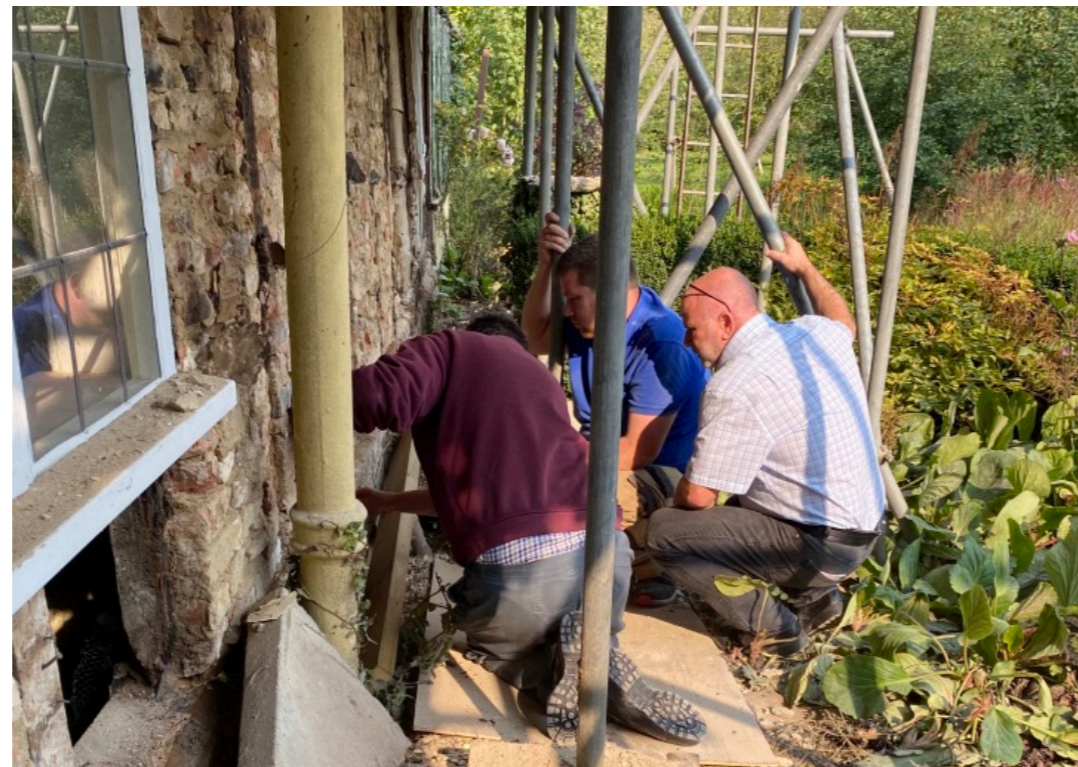
Timber frame repairs to South-east elevation