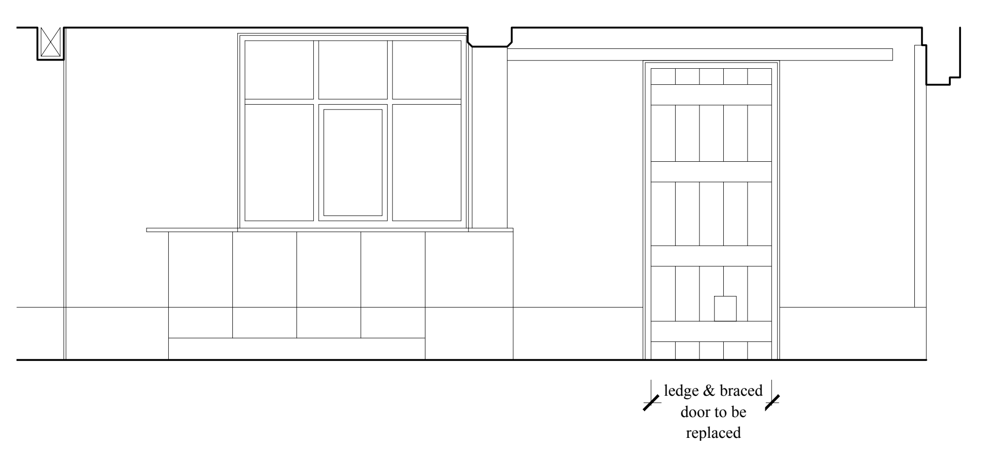
Existing internal south elevation of kitchen @ 1:25 scale