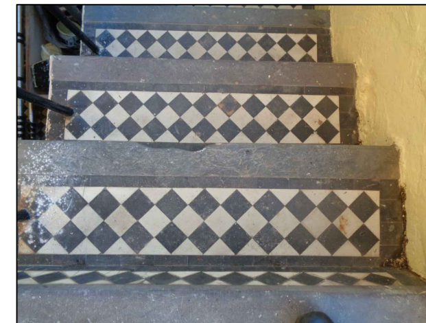
Proposed tiling pattern of front entrance steps similar to steps to the lower ground floor.

No changes to Tiling to lower ground floor.