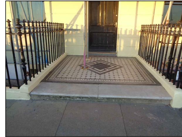
Existing tiling pattern of front entrance steps.