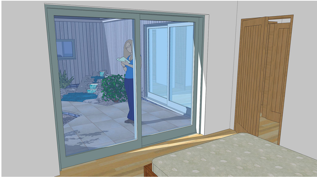
Main bedroom and studio bedroom to right opening out onto inner courtyard to create a quiet private space away from the main road