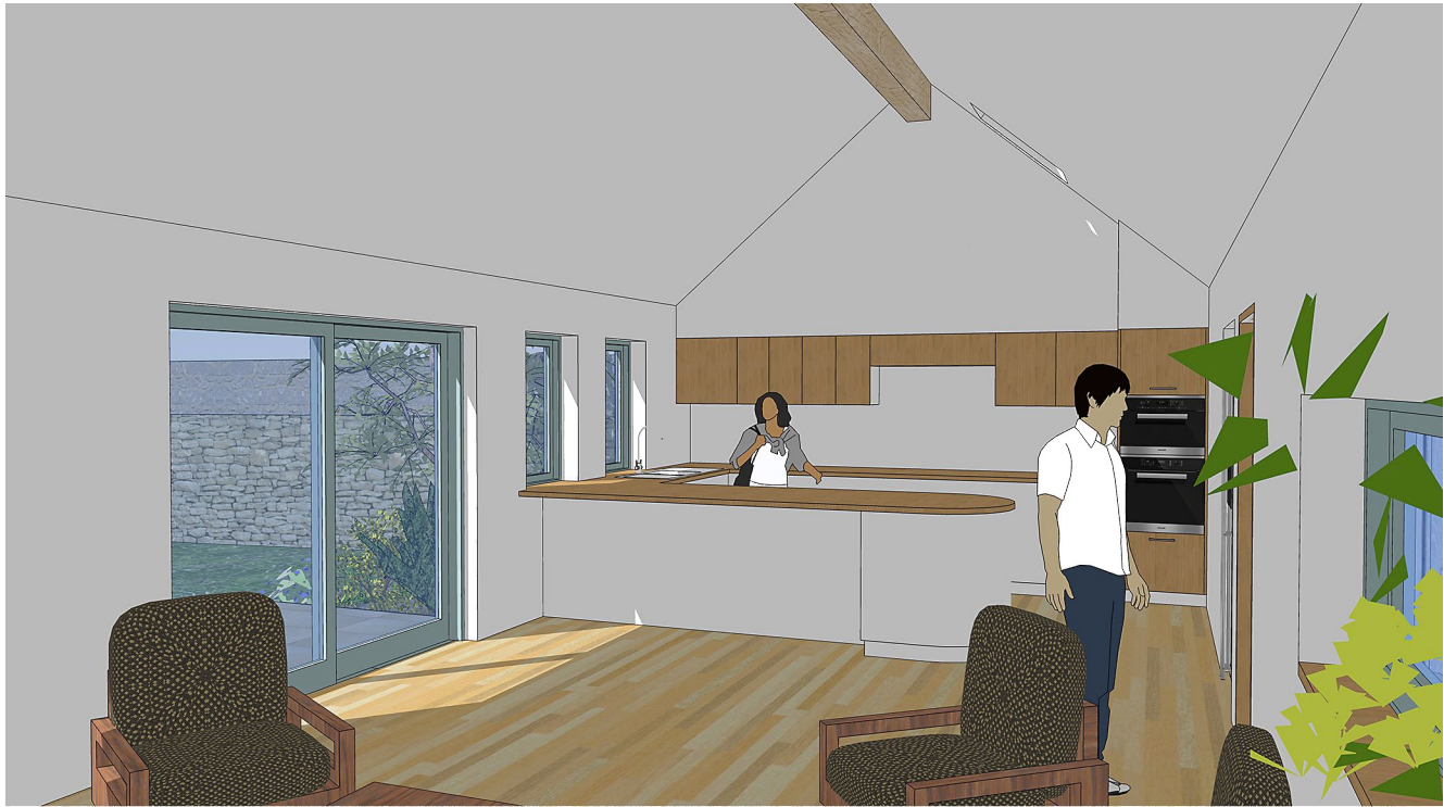
Open plan kitchen/dining/living area with full height ceiling to maximise sense of space