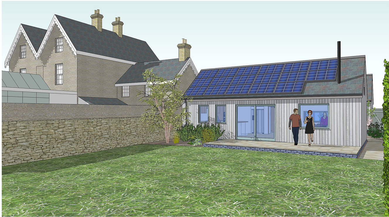
Rear/south view of proposed dwelling with existing stone wall raised to 2.4m in height to screen garden and conservatory of St Catherines House. existing pv solar panels relocated from garge roof and base onto new roof