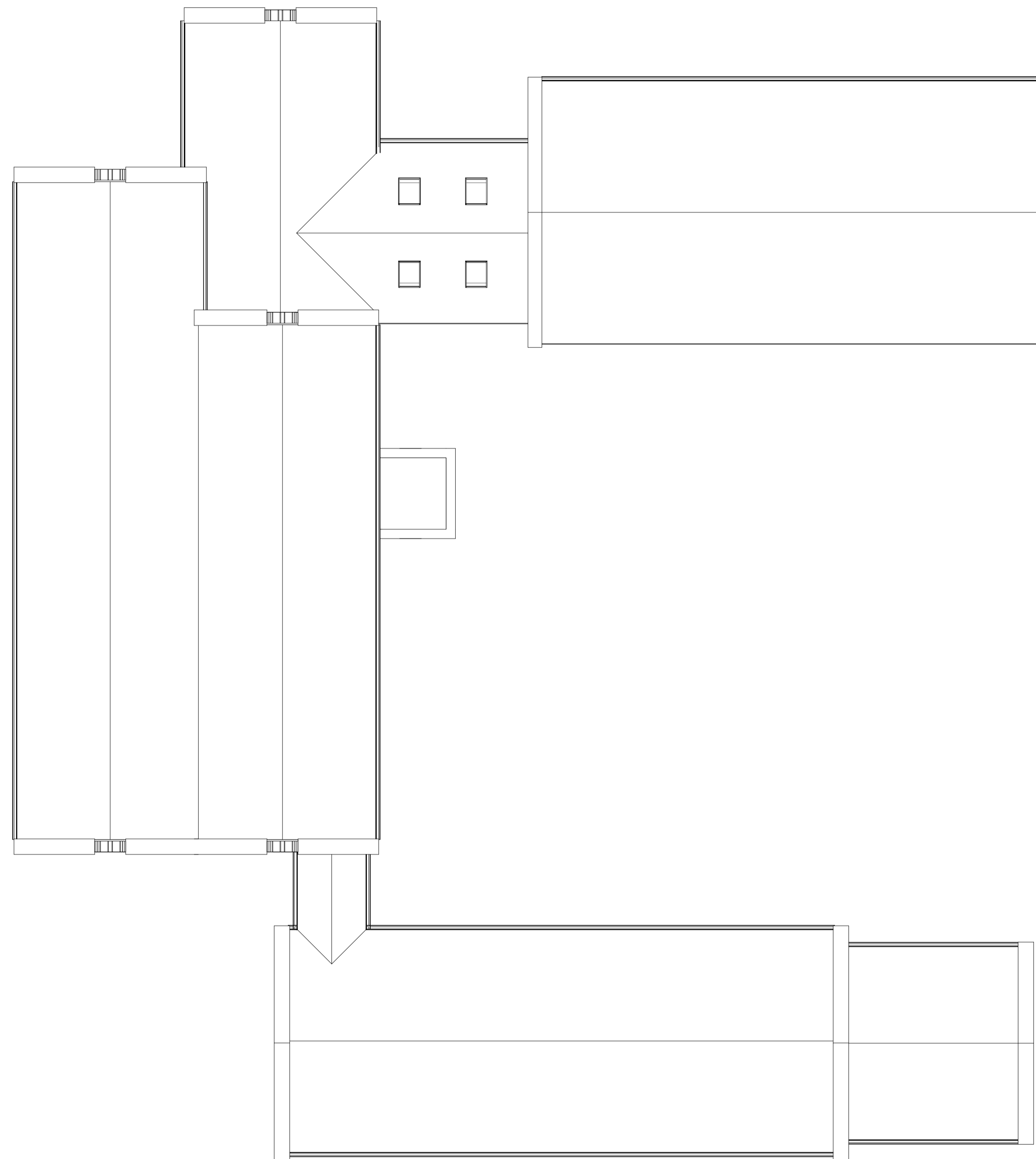
EXISTING ROOF PLAN

NOTES: NICHOLSON NAIRN ARCHITECTS OWN THE COPYRIGHT OF THIS DESIGN AND DRAWING WHICH MUST NOT BE REPRODUCED IN WHOLE OR PART WITHOUT THE WRITTEN PERMISSION OF NICHOLSON NAIRN ARCHITECTS DISCREPANCIES, AMBIGUITIES AND/OR OMISSIONS BETWEEN THIS DRAWING AND INFORMATION PROVIDED ELSEWHERE MUST BE REPORTED TO THE ARCHITECT BEFORE PROCEEDING DO NOT SCALE - ALL DIMENSIONS TO BE VERIFIED ON SITE