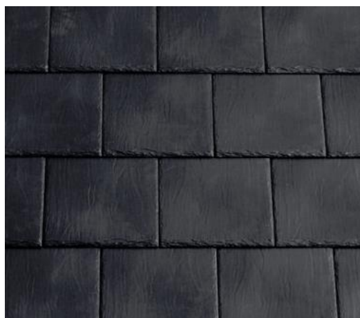
Barn D & E Conversion; Barn F New Build Sandtoft BritLock Slate