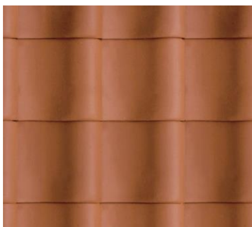
Barn C lean-to; & Barn B Replacement Sandtoft Koramic Old Hollow 45l Natural Red