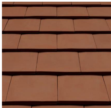
Barn C – Sandtoft 20/20 Natural Red