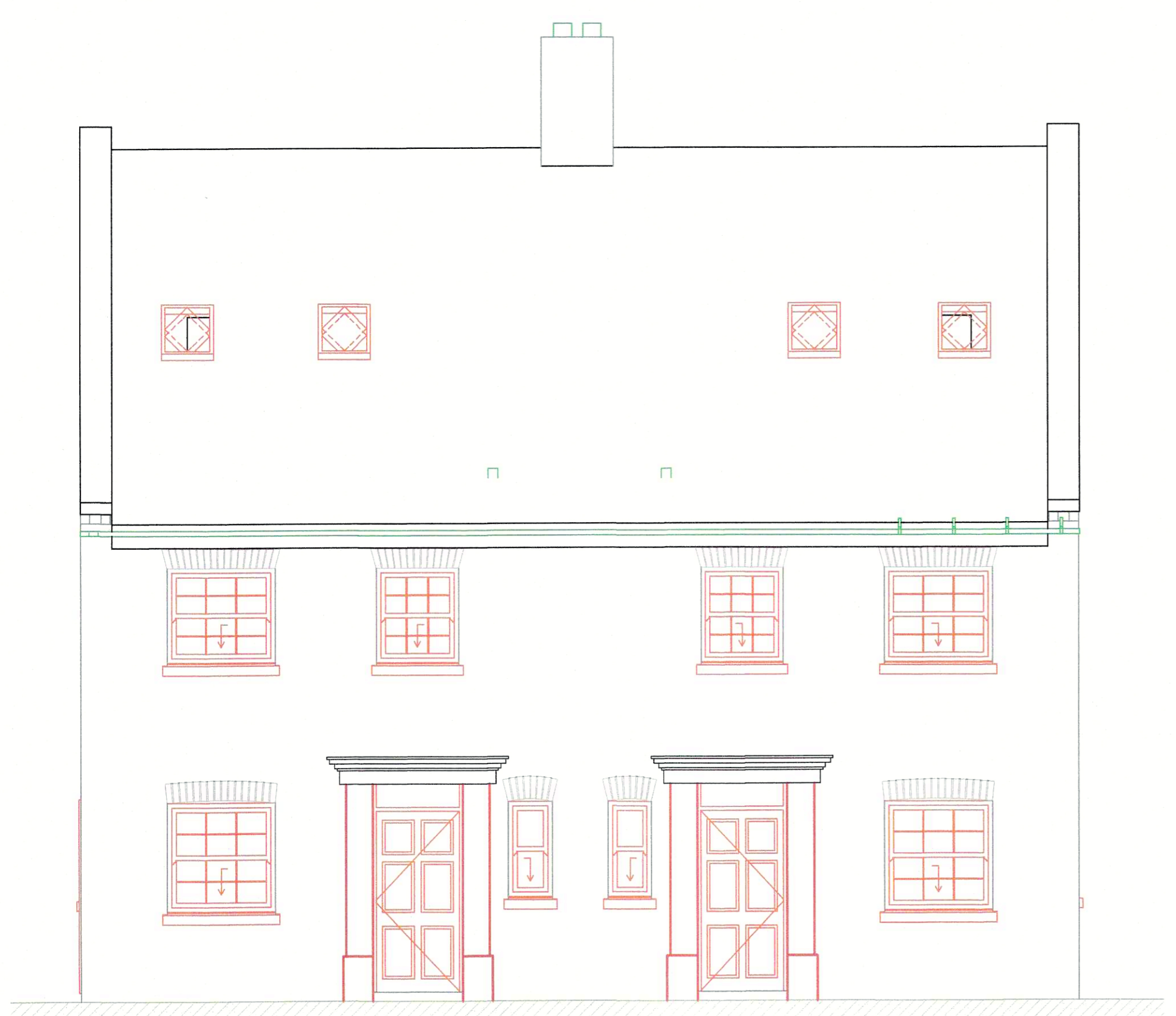
E-1201 1 and 2 South Elevation 1:50

Scale at 1:5 - 250mm, 1:10 - 500mm, 1:20 - 1.0m, 1:50 - 2.5m, 1:100 - 5.0m, 1:200 - 10m, 1:500 - 25m Dimensions of wall thicknesses are finished dimensions