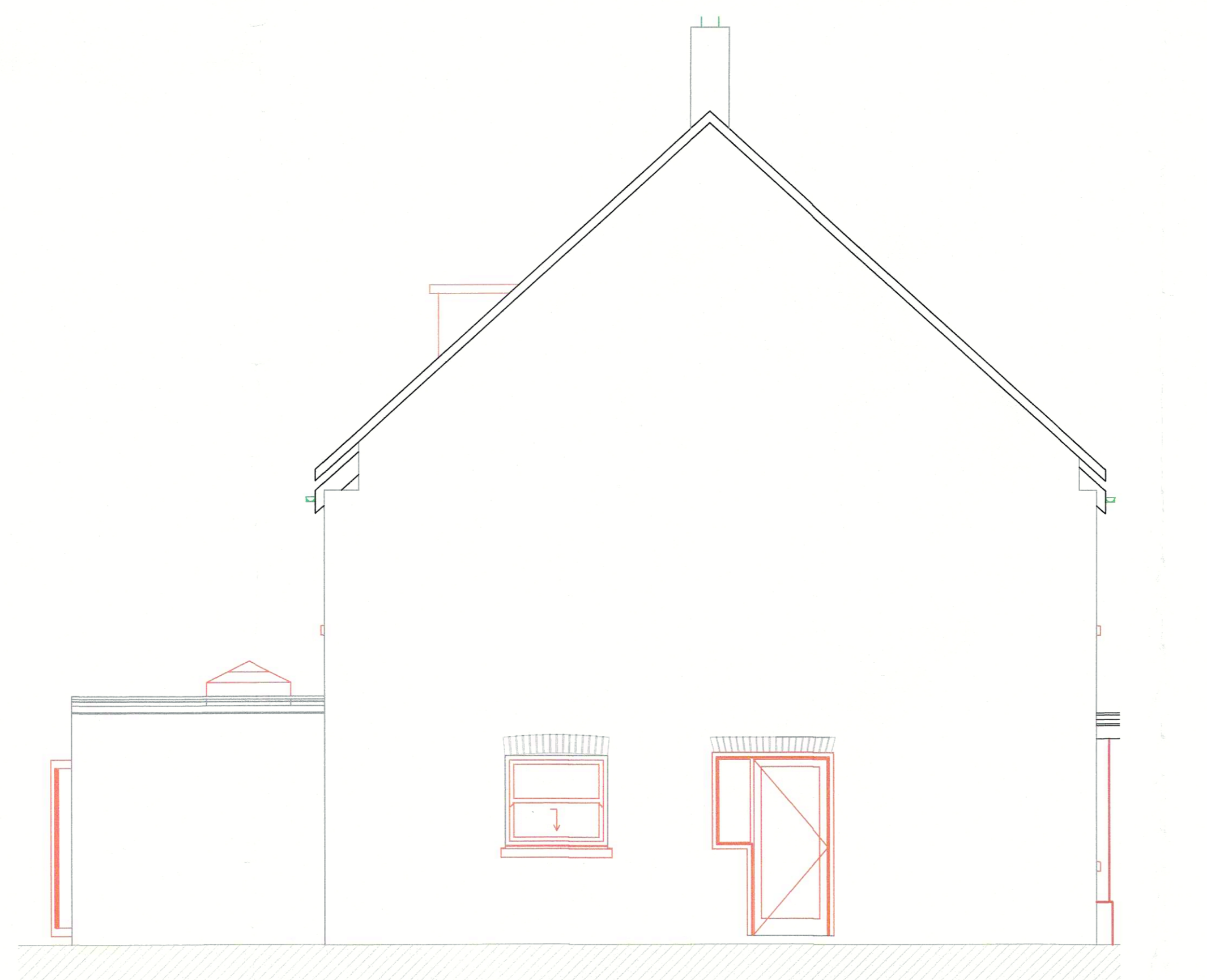
E-1204 1 and 2 West Elevation 1:50