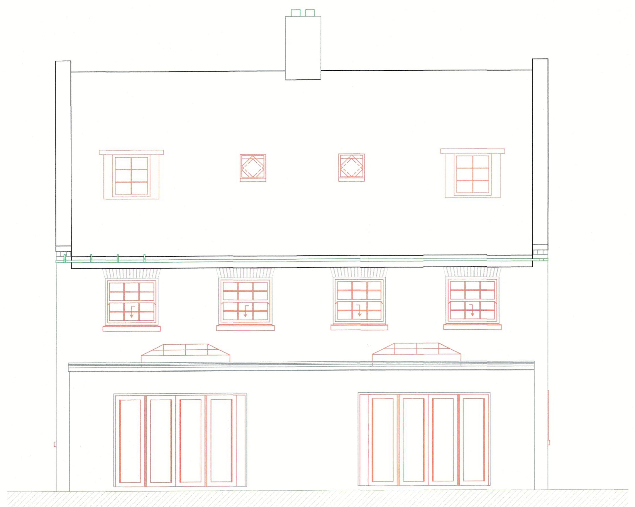
E-1203 1 and 2 North Elevation 1:50