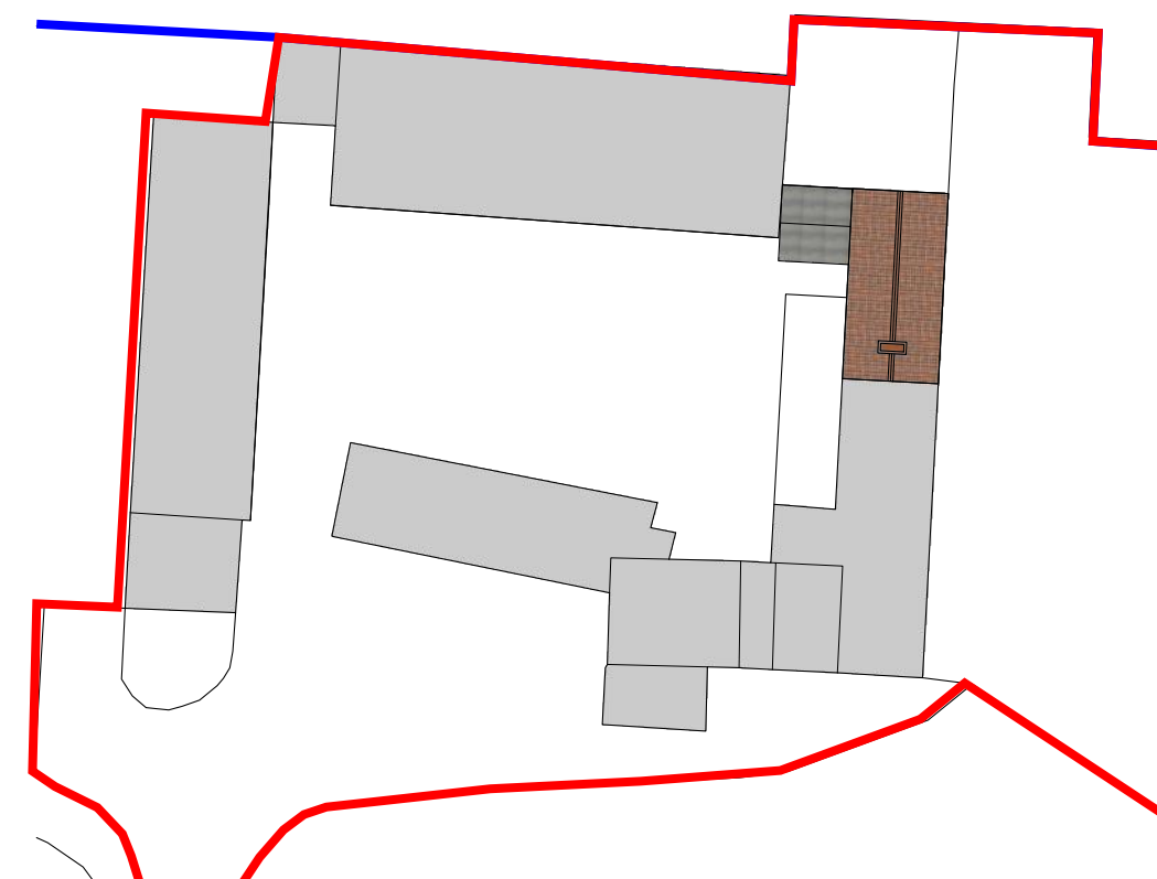
Existing Site Plan Scale: 1:500