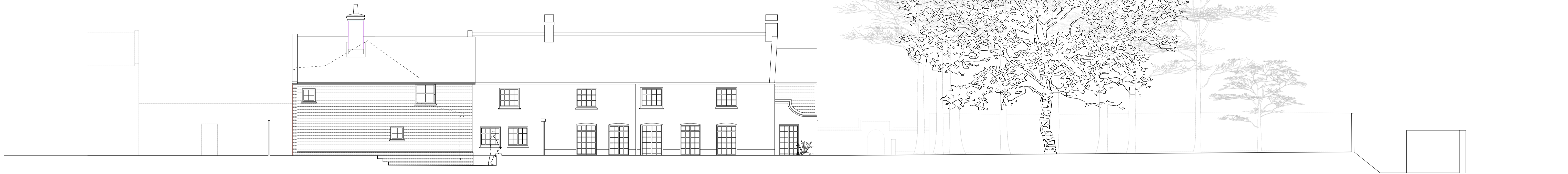
SECTION B FACING NORTH, THRO' LOGGIA 1:100 @ A1