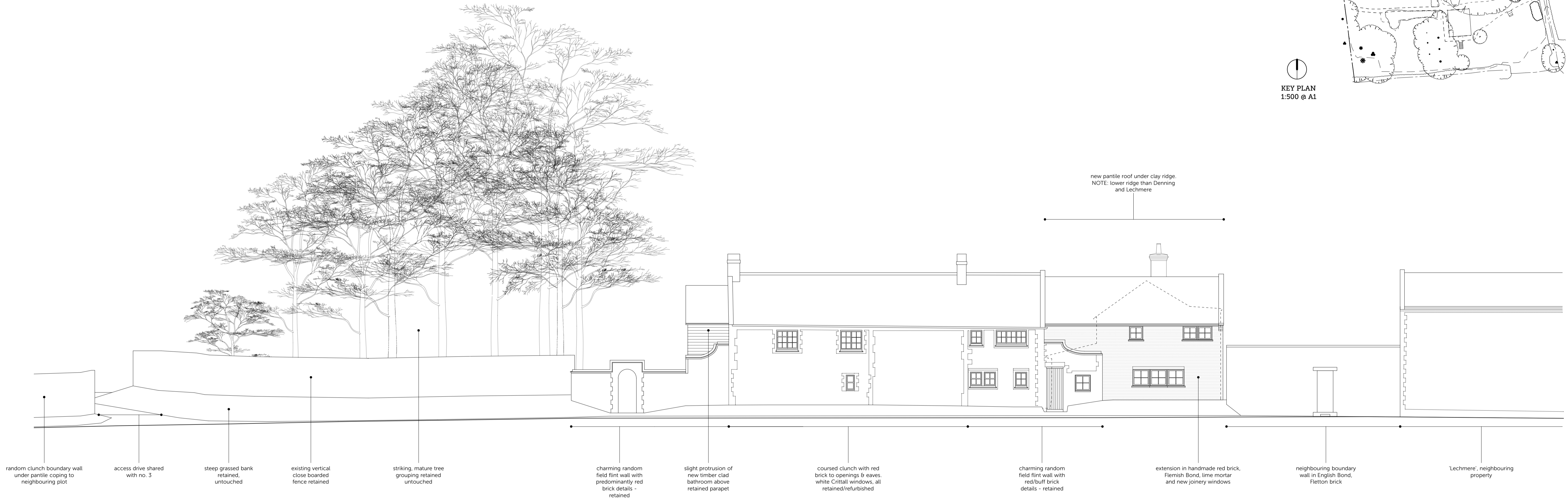
NORTH (STREET) ELEVATION 1:100 @ A1