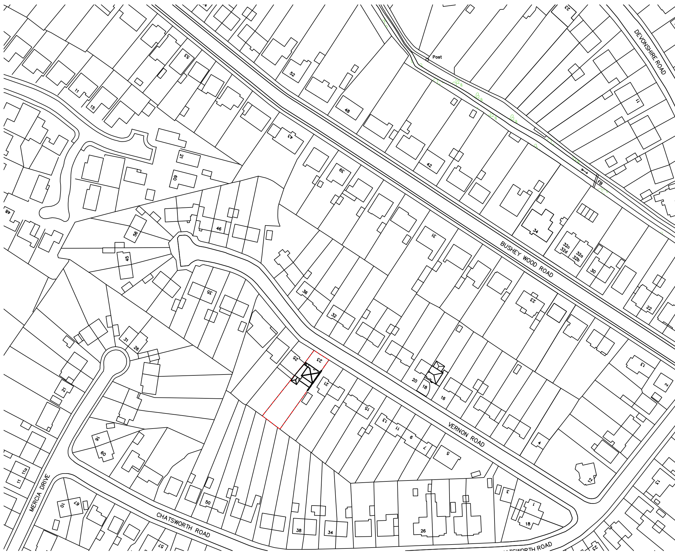
existing site location plan

Disclaimer: This drawing is copyright and shall not be reproduced nor used for any other purpose without the written permission of Millhouses Design Limited. This drawing must be read in conjunction with all other related drawings and documentation. It is the contractor's responsibility to ensure full compliance with the Building Regulations. Do not scale from this drawing, use figured dimensions only. It is the contractor's responsibility to check and verify all dimensions on site. Any discrepancies to be reported immediately. IF IN DOUBT ASK. Materials not in conformity with relevant British or European Standards/Codes of practice or materials known to be deleterious to health & safety must not be used or specified on this project.