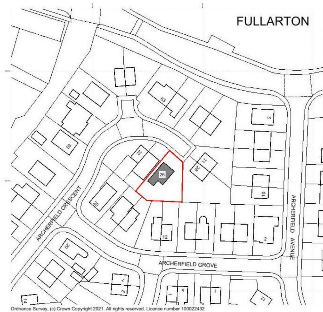
location plan red line indicates extent of application site Scale 1:1250 @ A3