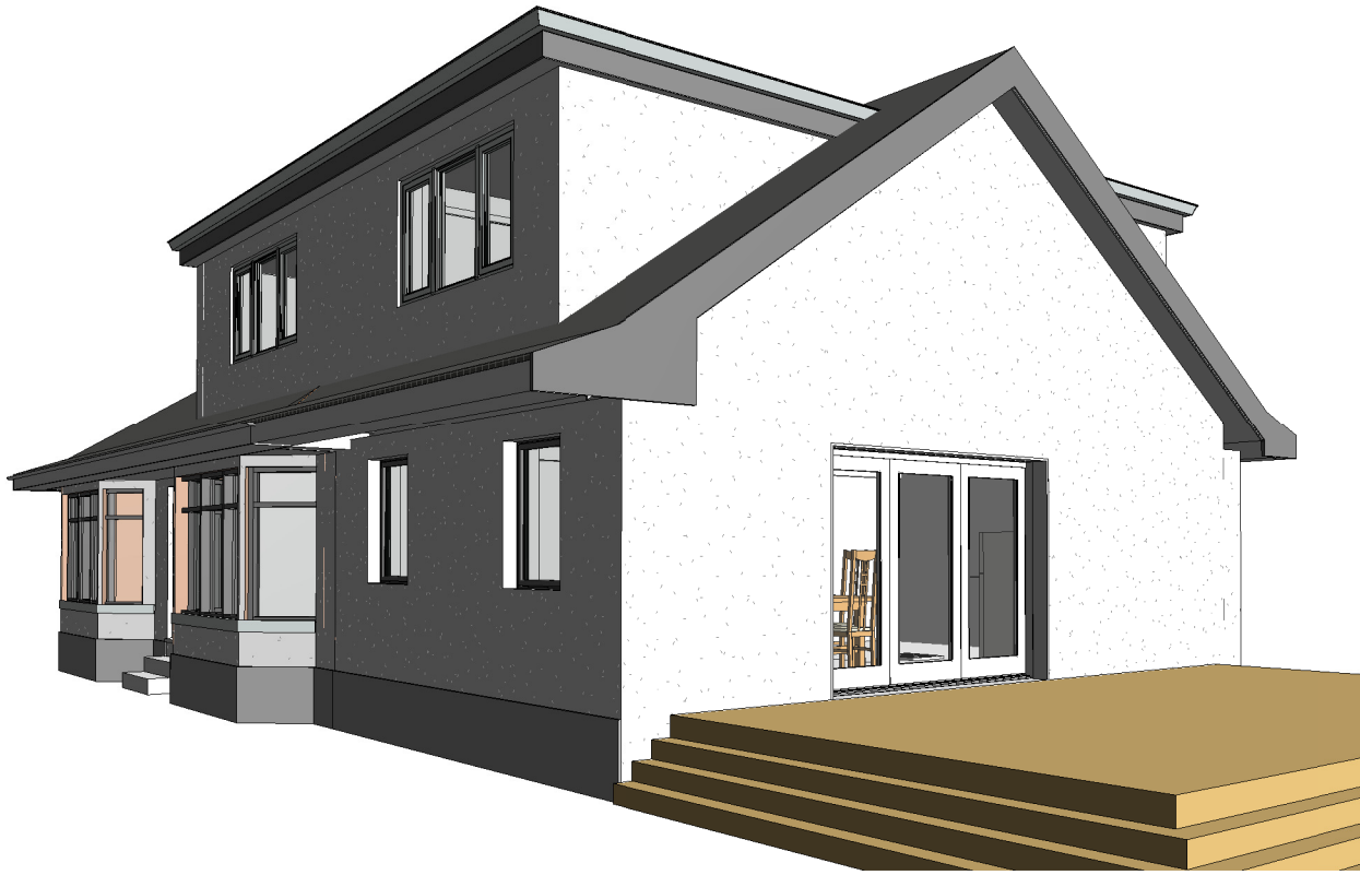
3D View Isometric Facing Extension

ALL DIMENSIONS TO BE CHECKED ON SITE DO NOT SCALE FROM THIS DRAWING. USE FIGURED DIMENSIONS ONLY. IF IN DOUBT ASK. THIS DRAWING IS THE COPYRIGHT OF CRGP LTD. AND SHOULD NOT BE REPRODUCED IN ANY FORMAT WITHOUT PRIOR APPROVAL.