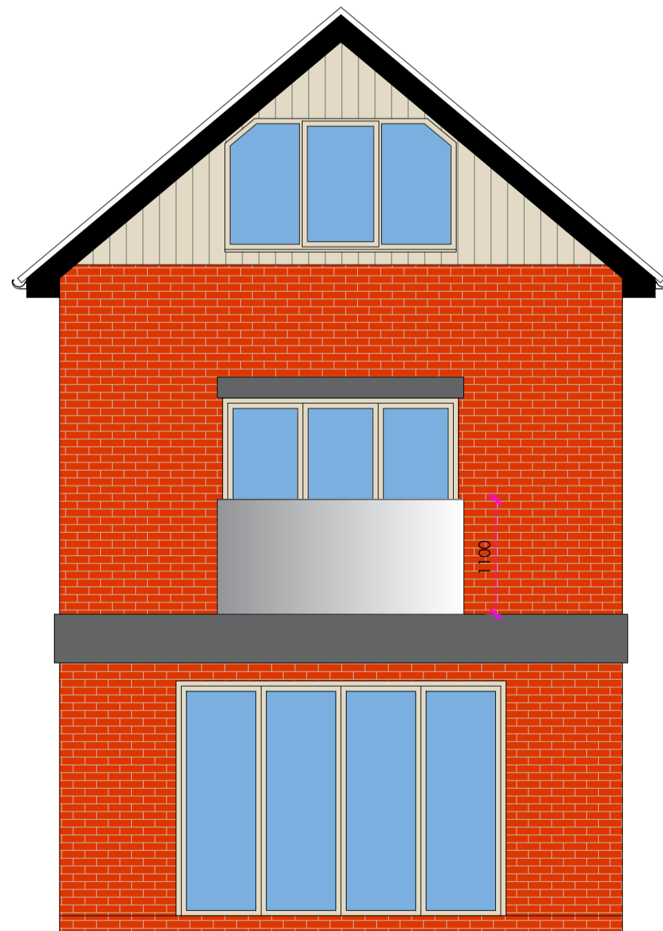
No. 135 - Proposed Rear Elevation