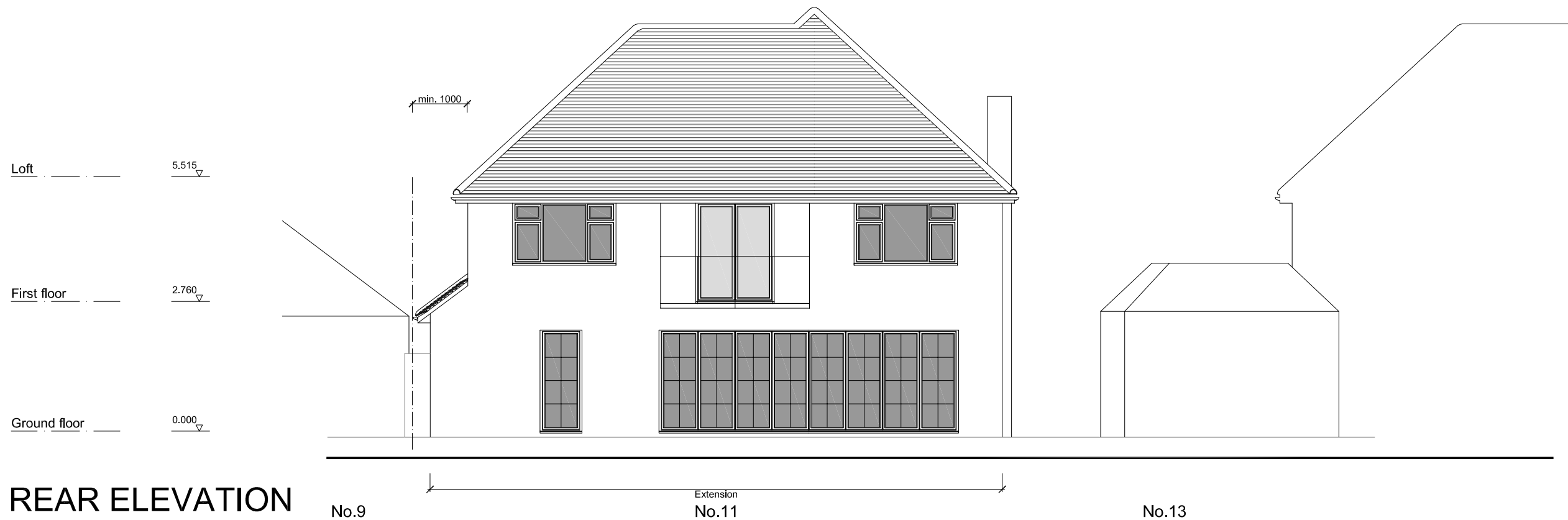
REAR ELEVATION (North West)