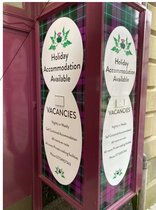
Signs to right hand side of entrance and recess