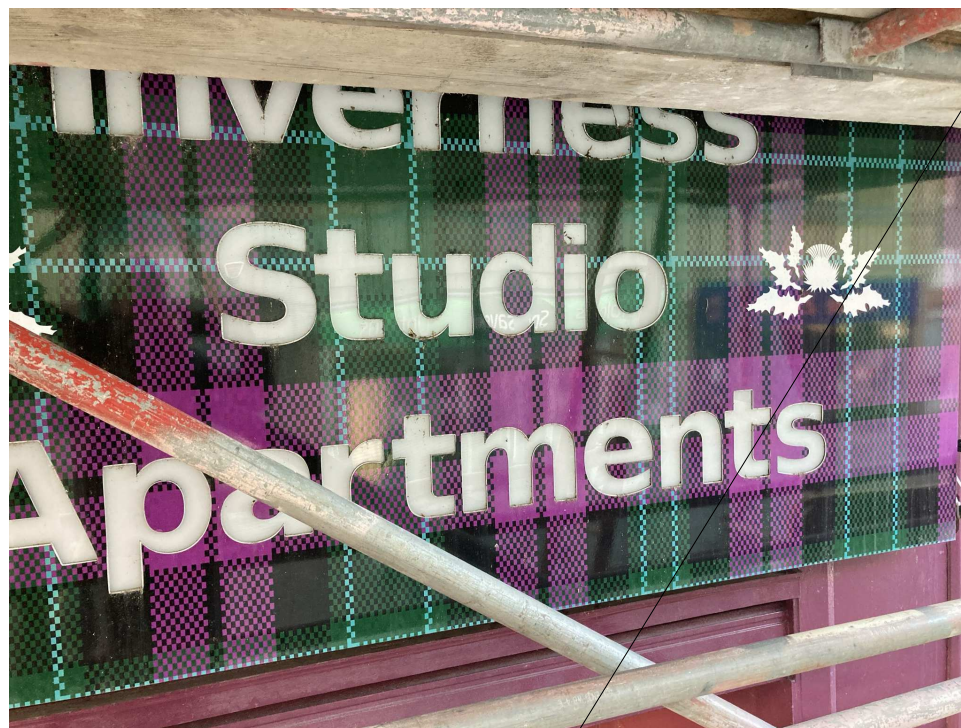
Illuminated sign above doorway. During 2020 this has been obscured by scaffolding due to the repair / re-roffing works.