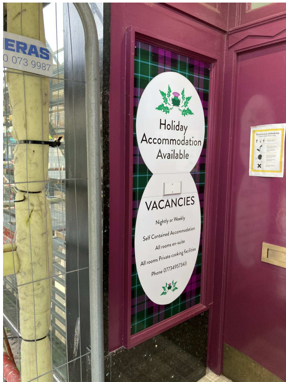
Sign to left hand side of entrance recess