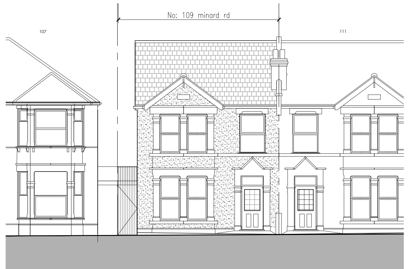
Front elevation (west) SCALE - 1:100 Proposed