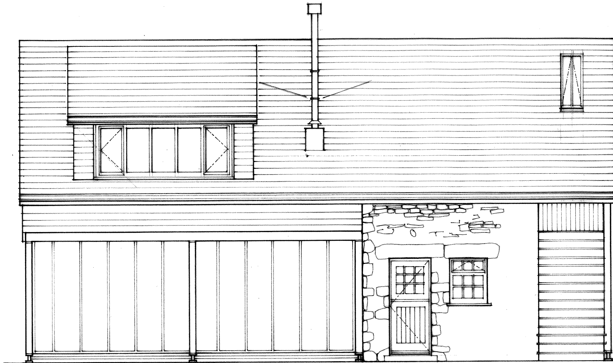
SOUTH WEST ELEVATION PROPOSED