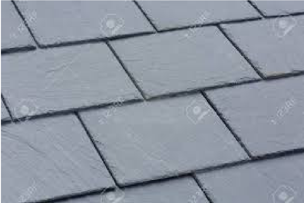
SLATE ROOF TILES