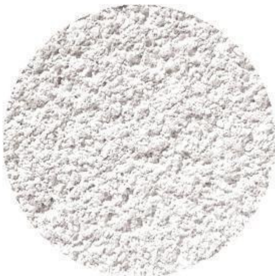
WHITE RENDER EXTERNAL WALL FINISH