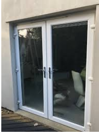
WHITE ALUMINIUM DOORS