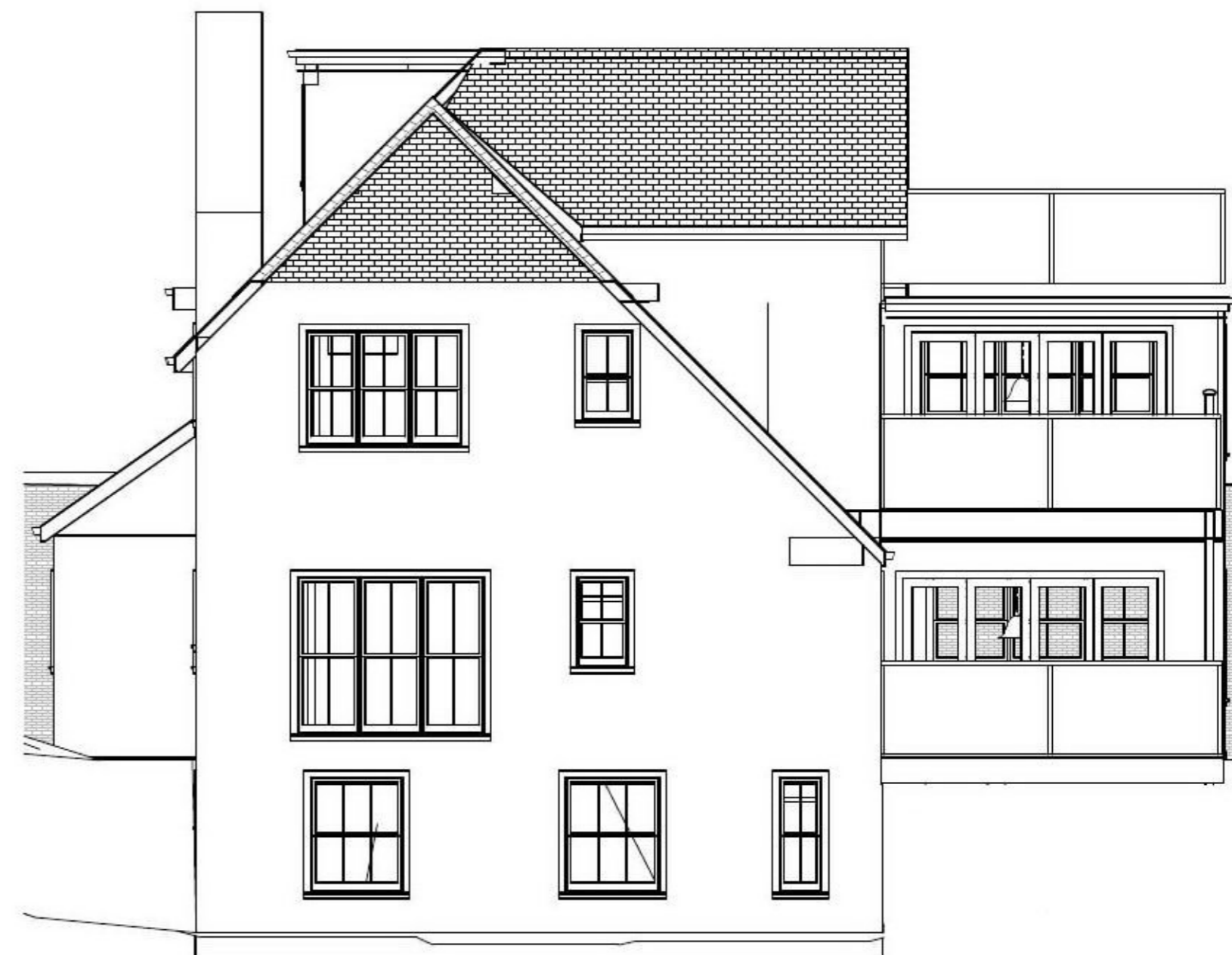
PROPOSED WEST ELEVATION SCALE 1:100