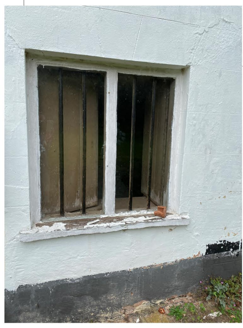
WG11 existing photo