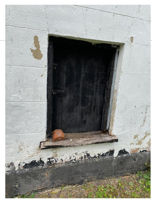
WG13 existing photo