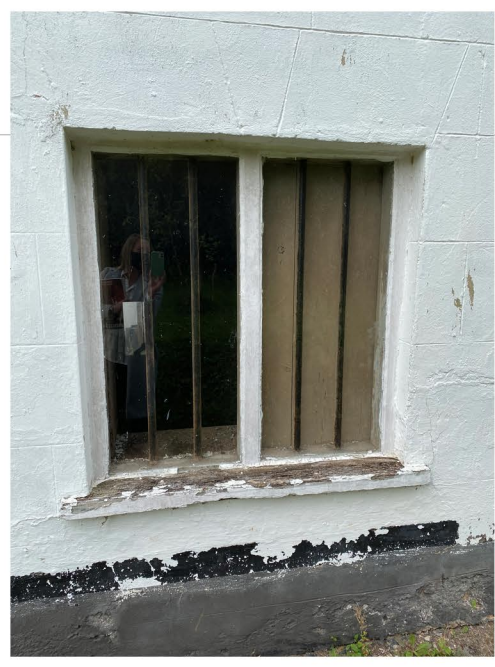
WG12 existing photo