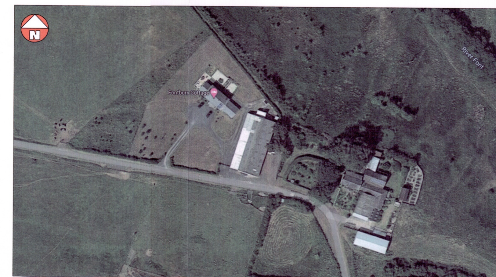
AERIAL VIEW Not to scale

New Surface Water Drainage System Connected To Existing Surface Water Drainage System. Proposed New Pitch Slate Roof, is same size as Existing Roof. Therefore Volume of Surface Water Remains the same and Therefore there is No Extra Capacity / Burden on the Existing Surface Water Drainage System.