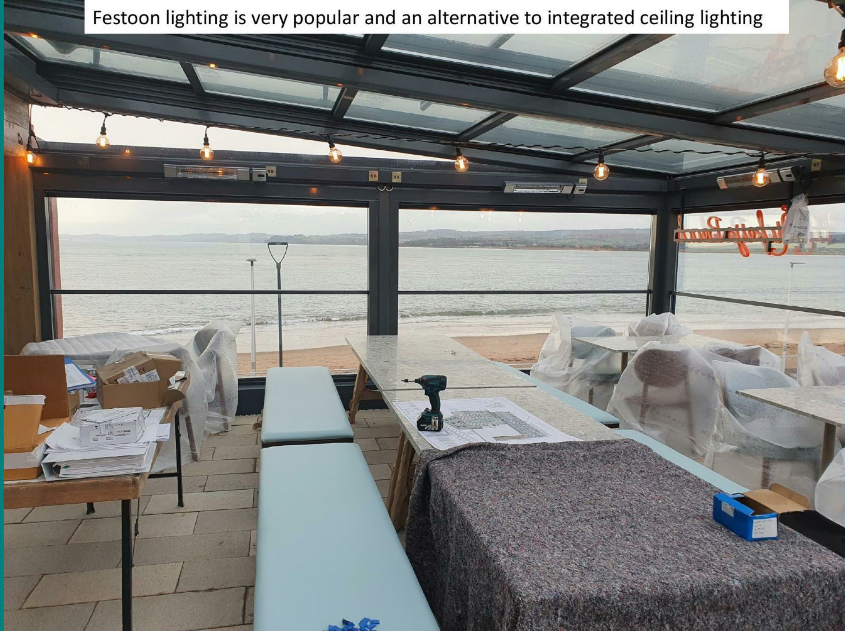
Festoon lighting is very popular and an alternative to integrated ceiling lighting