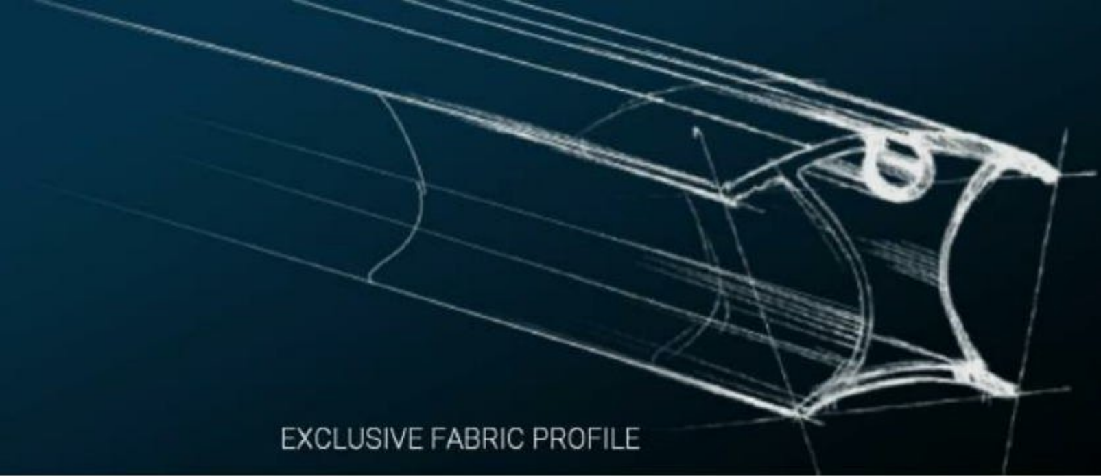
EXCLUSIVE FABRIC PROFILE