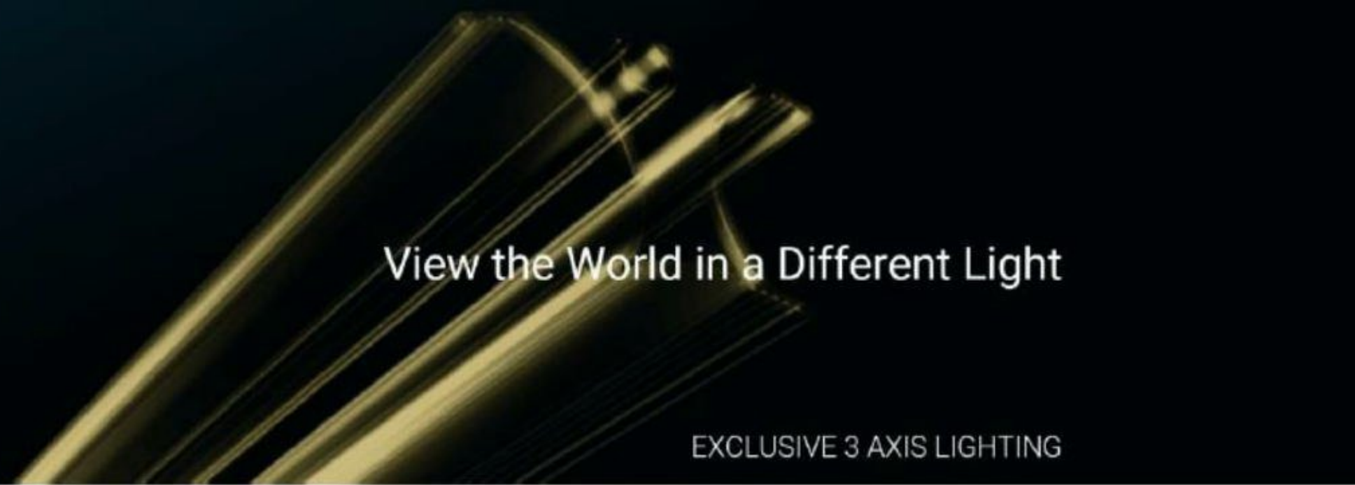
View the World in a Different Light