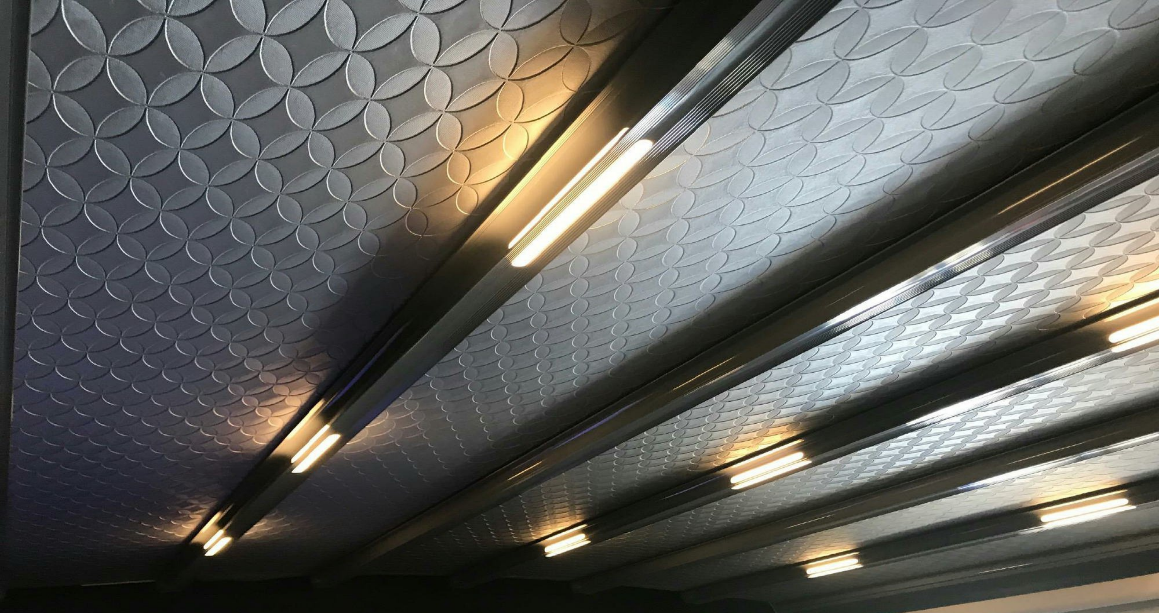
3 axis lighting and exclusive fabric gives a luxurious aesthetic