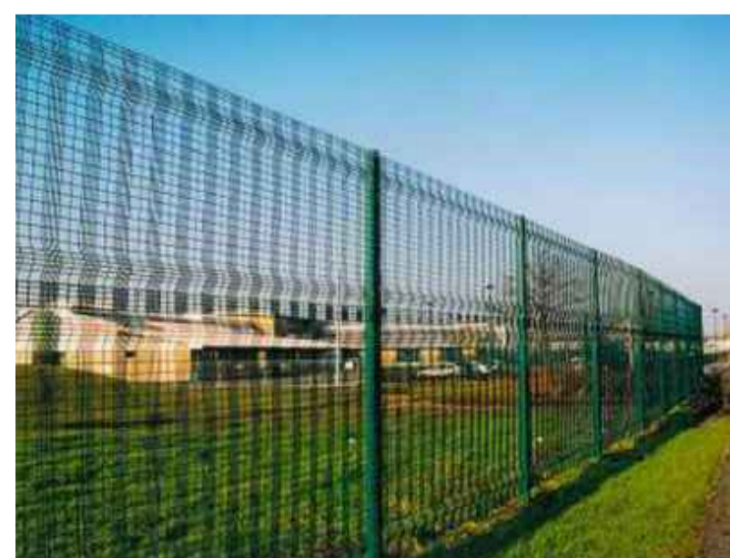
Paladin Fencing Precedent