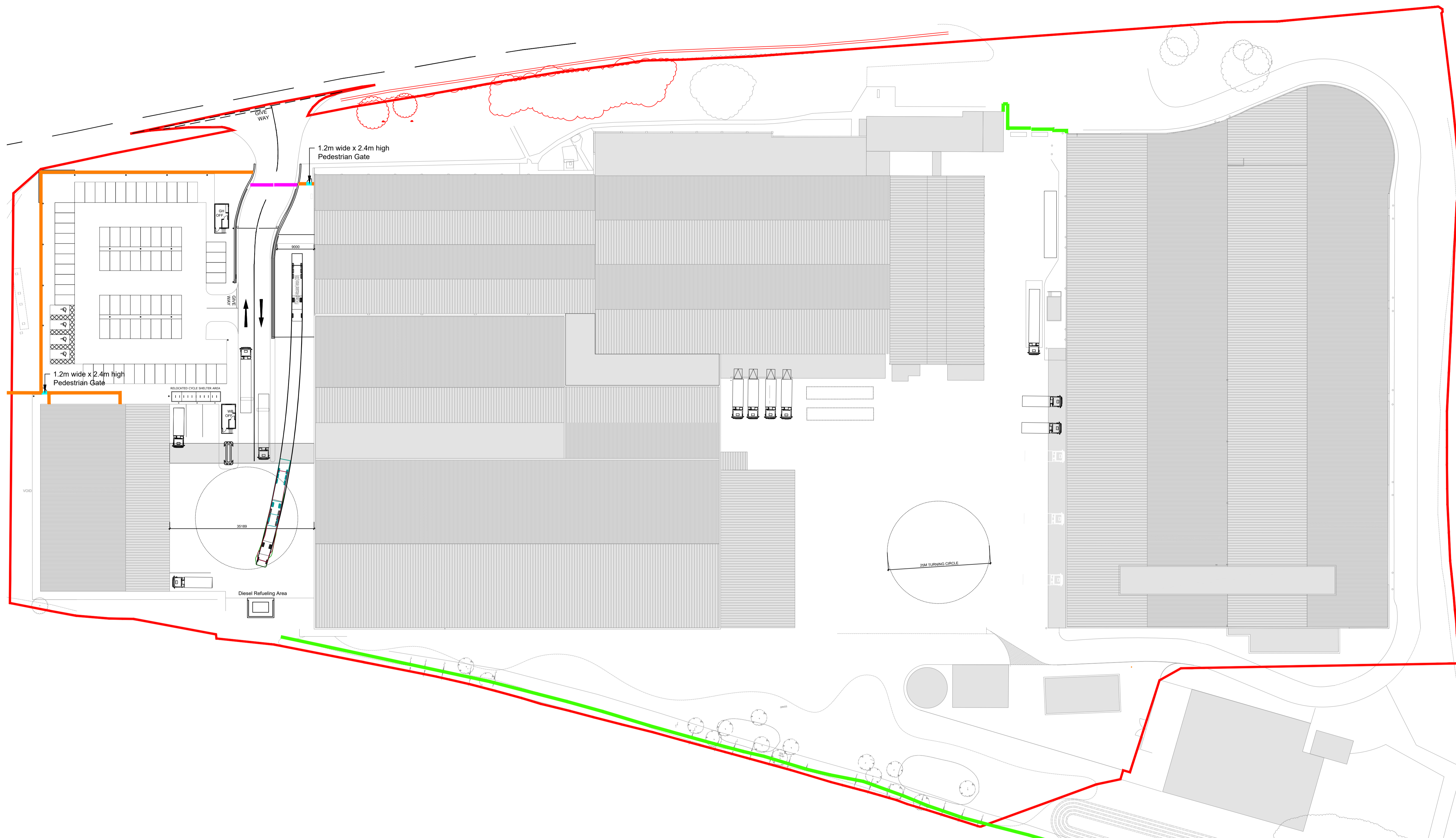
Proposed Fence Plan (Scale 1:500)