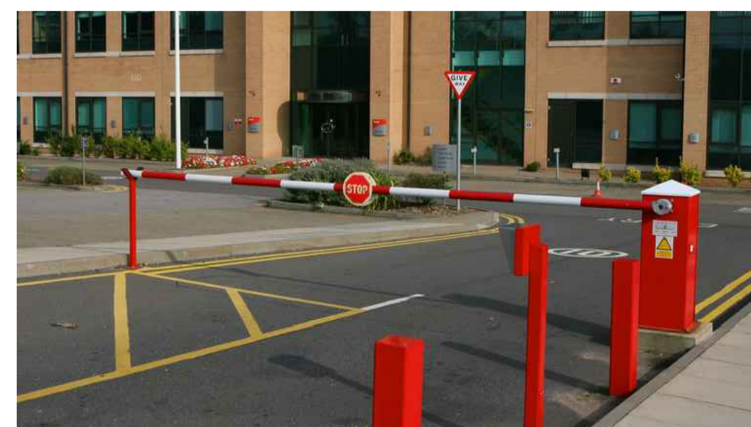
Security Barrier Precedent