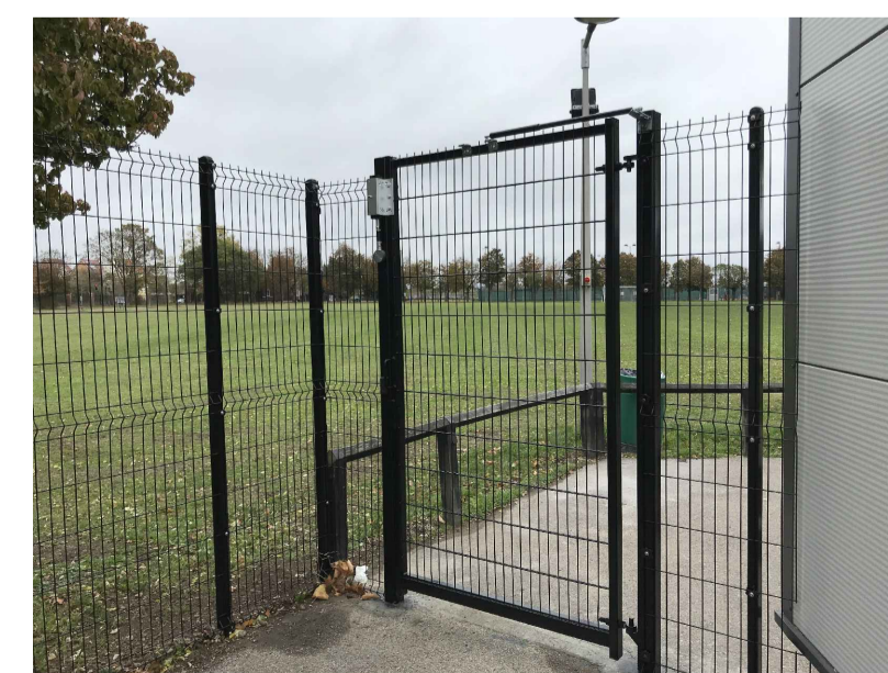
Pedestrian Security Gate Precedent