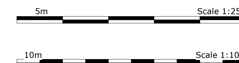
Key Plan 1 : 1000