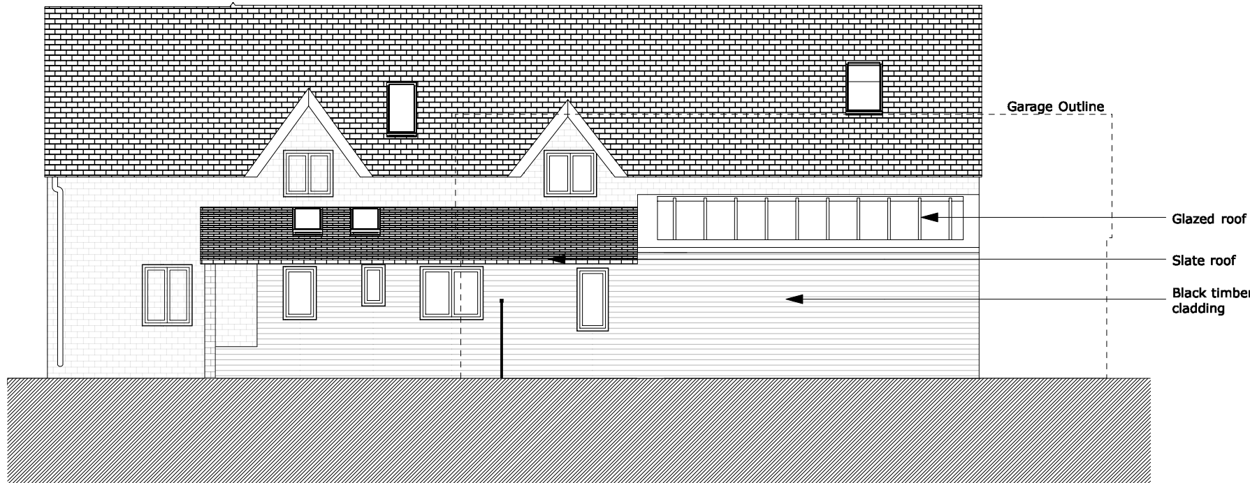
2 East Elevation BB Scale: 1:100