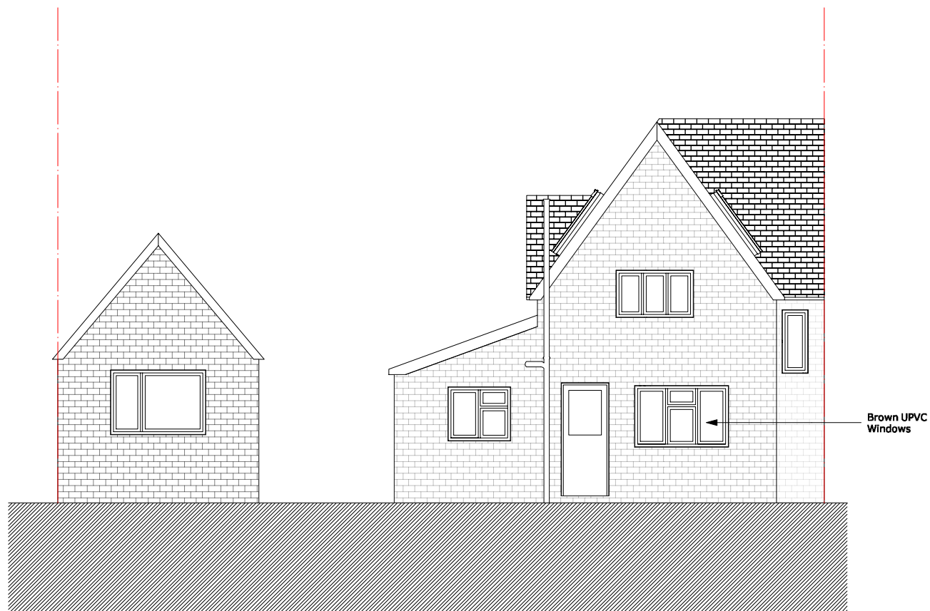
3 Rear Elevation Scale: 1:100