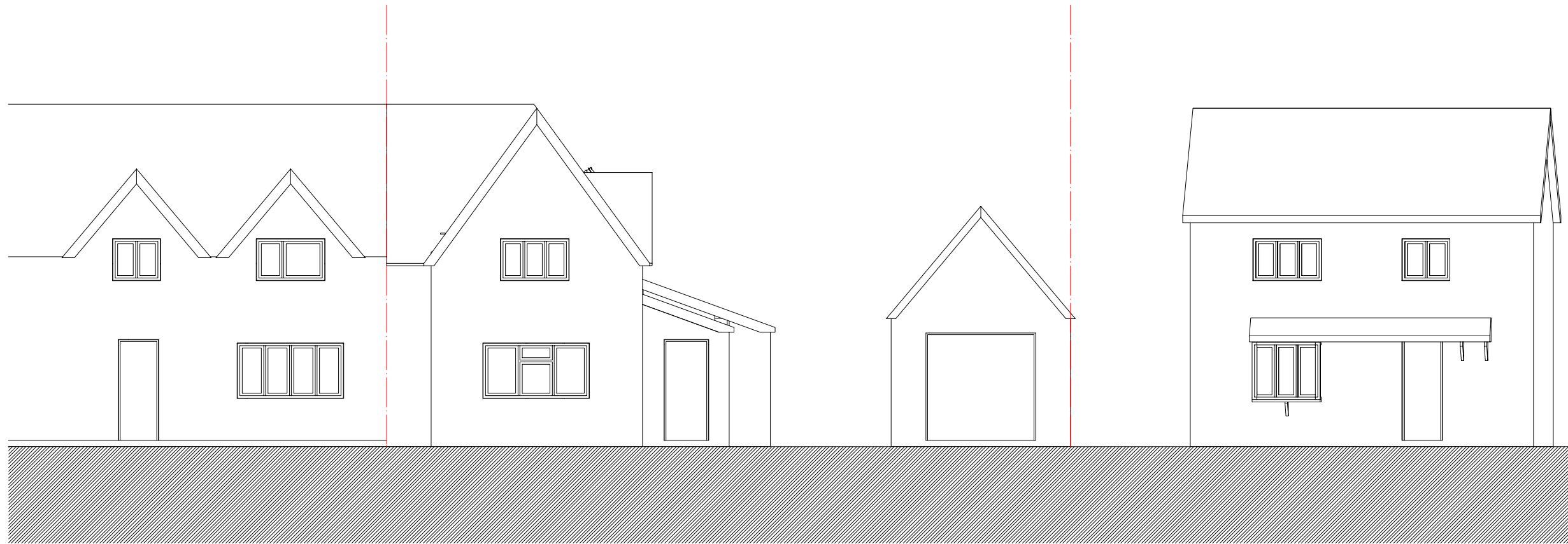
1 Existing Street Elevation Scale: 1:100