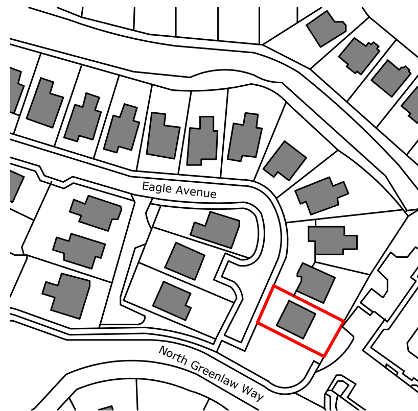
Location Plan SCALE 1:1250 0 10m 50m N