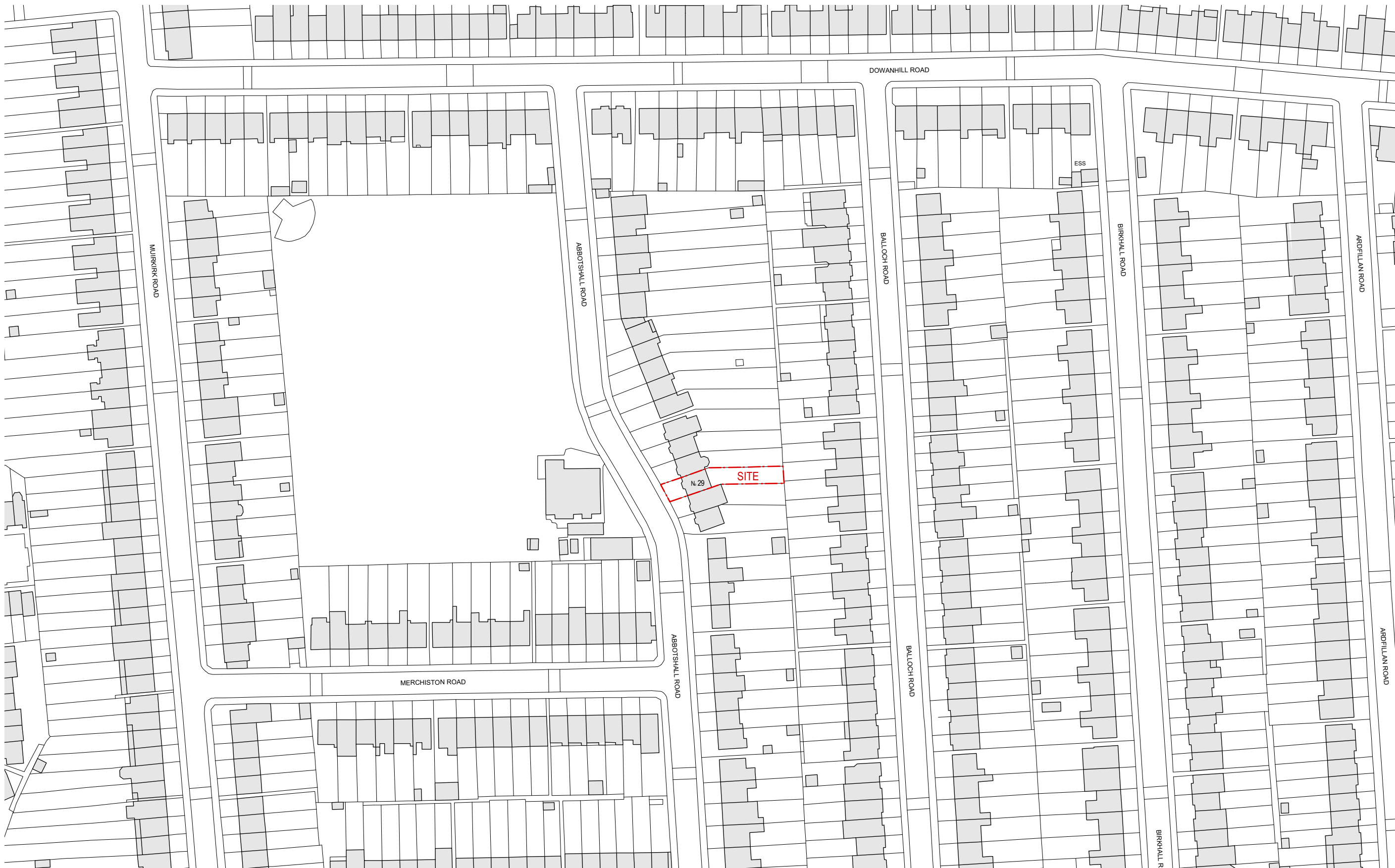
Existing Location Plan 1:1250