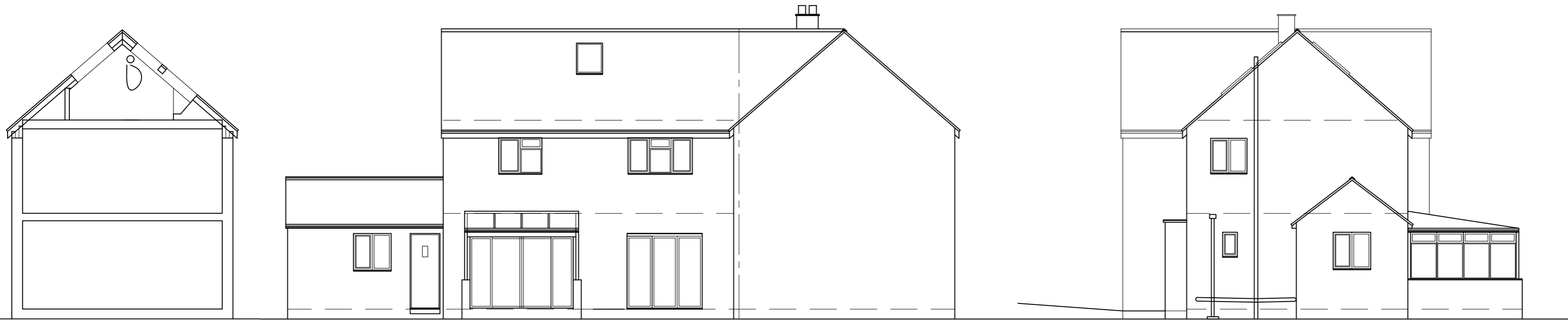
TYPICAL SECTION(A-A) Existing

Work only to figured dimensions All dimensions to be checked on site Any discrepancies reported This drawing is protected by the Copyright Acts