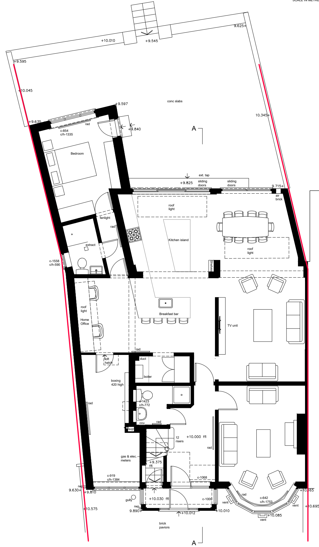
Ground Floor Plan Proposed