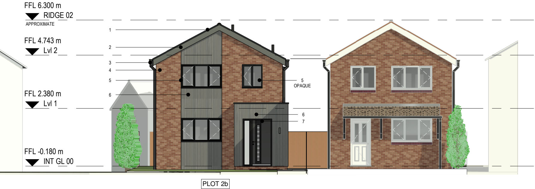
East Elevation Scale : 1 : 100