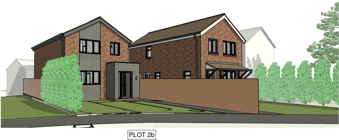
3D View 1 Scale :