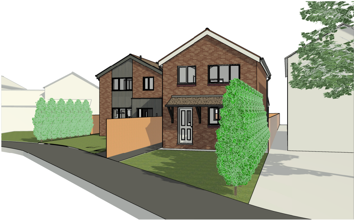
3D View 2 Scale :