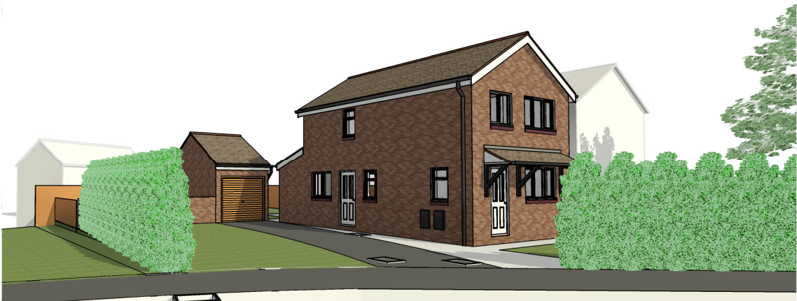
3D View 1 Scale :