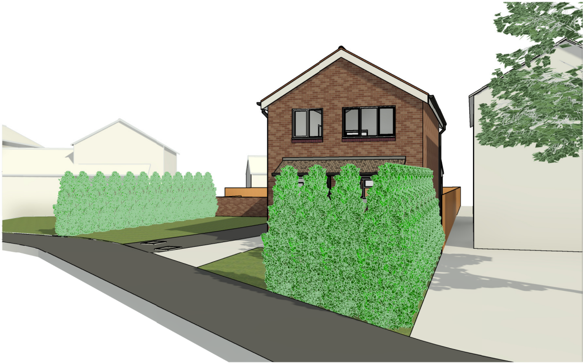
3D View 2 Scale :