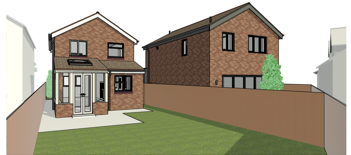
3D View 3 Scale :