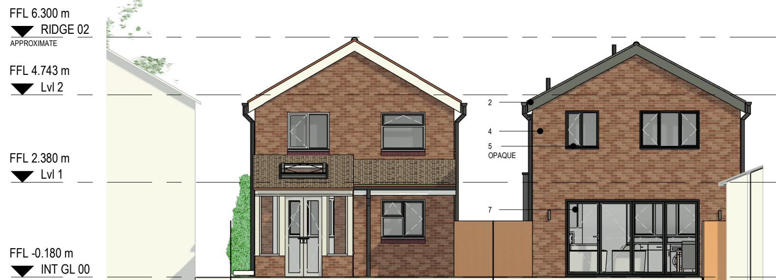
West Elevation Scale : 1 : 100