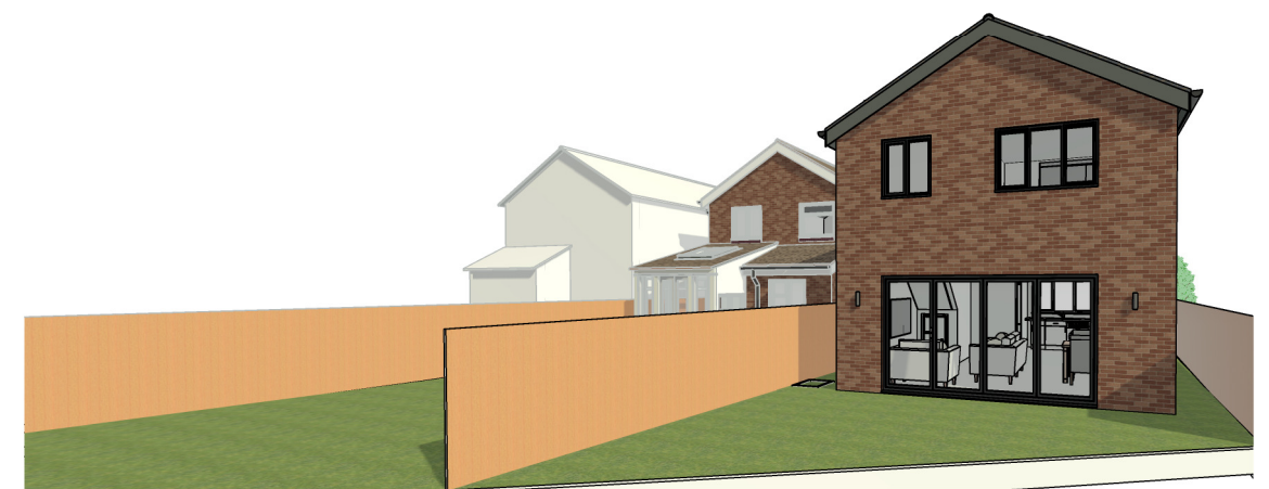
3D View 4 Scale :