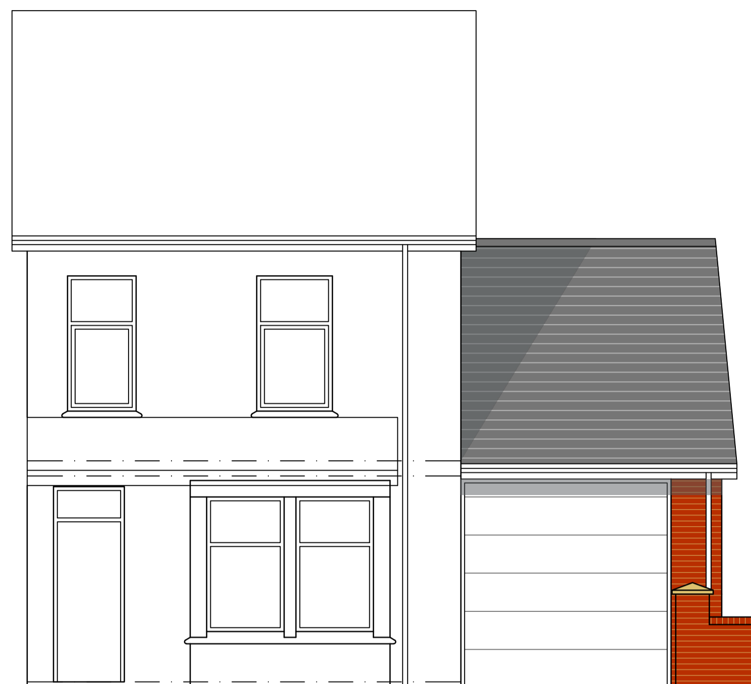
PROPOSED FRONT ELEVATION - STREET SCENE

general notes: do not scale the drawing. all dimensions to be checked on site prior to commencement of work and any discrepancy shall be immediately reported and resolved prior to work commencing. this drawing is to be read in conjunction with all relevant drawings and specifications relating to the job whether or not indicated on the drawing. copyright reserved to clover architectural design limited and this drawing may not be used or reproduced without prior written consent.